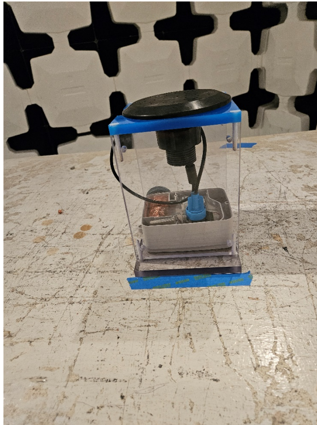
Figure 1. Pit Antenna in Test Jig