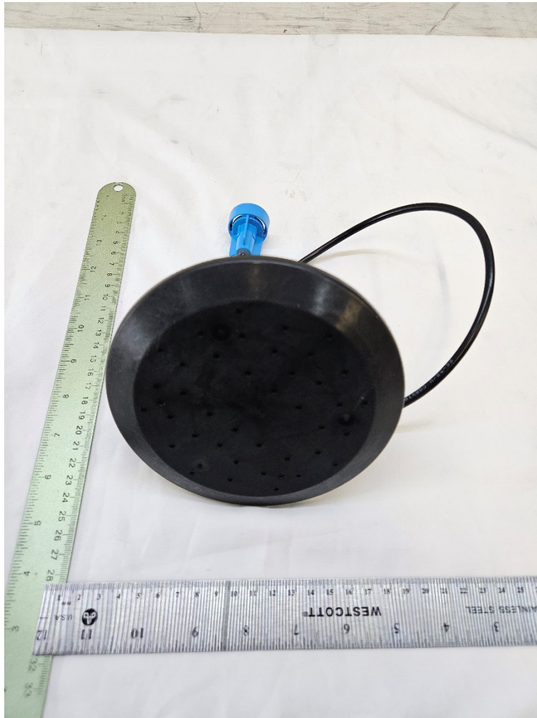
Figure 2. Pit Antenna Standalone

FCC Part 15 Class II Permissive Change P2SR900CE 4171B-R900CE 24-0097 April 17, 2024 Neptune Technology Group, Inc. R900