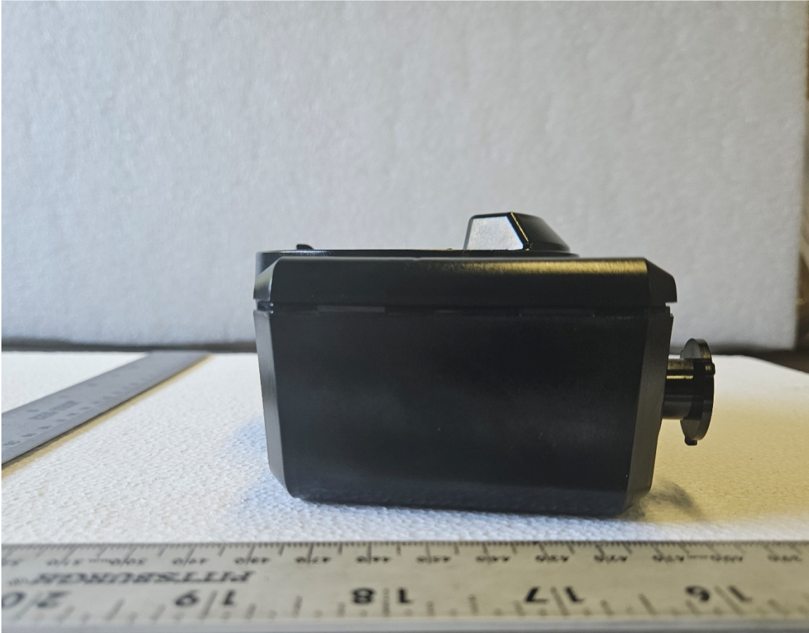
Figure 6. Side 2

FCC Part 15 Certification/ RSS 247 P2SR900CE 4171B-R900CE 23-0195 October 17, 2023 Neptune Technology Group Inc. R900