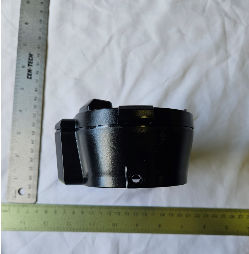
Figure 4. Back

FCC Part 15 Certification/ RSS 247 P2SR900CE 4171B-R900CE 23-0195 October 17, 2023 Neptune Technology Group Inc. R900