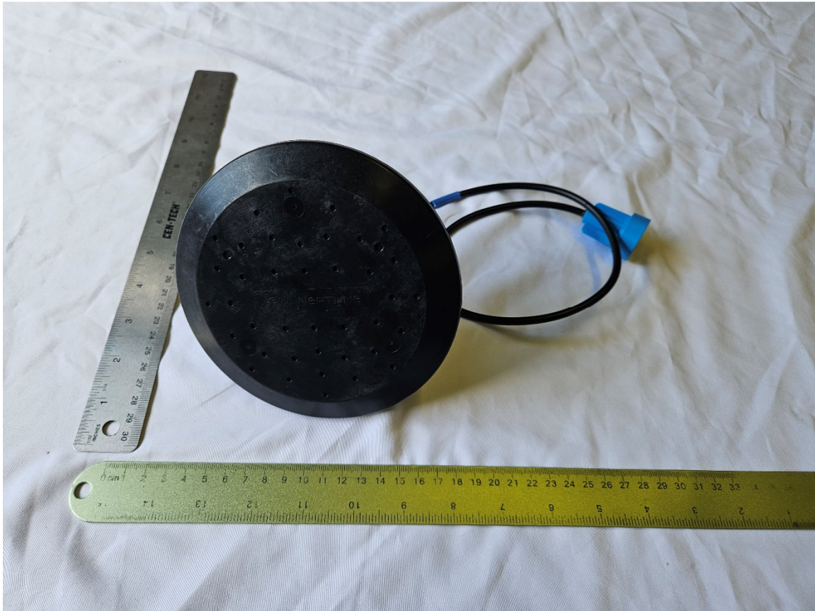
Figure 7. Antenna

FCC Part 15 Certification/ RSS 247 P2SR900CE 4171B-R900CE 23-0195 October 17, 2023 Neptune Technology Group Inc. R900