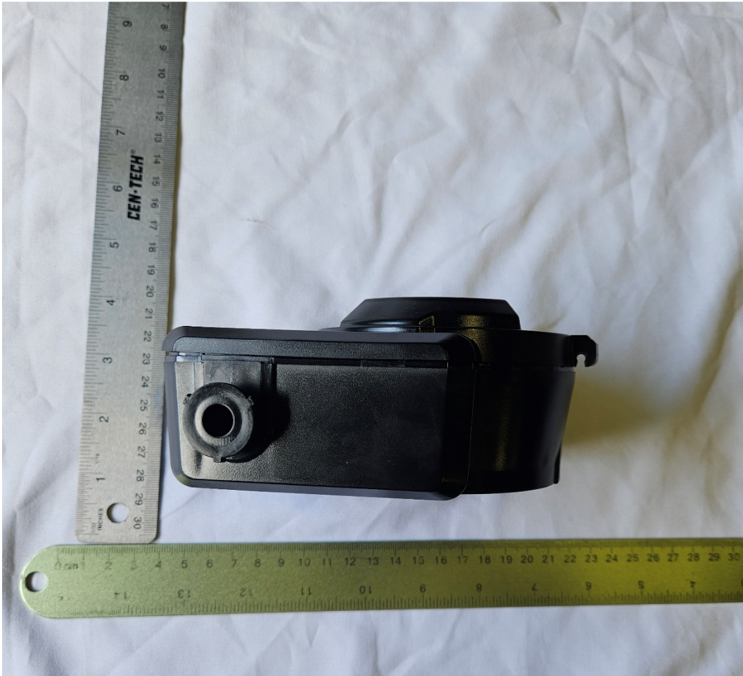
Figure 3. Front

FCC Part 15 Certification/ RSS 247 P2SR900CE 4171B-R900CE 23-0195 October 17, 2023 Neptune Technology Group Inc. R900