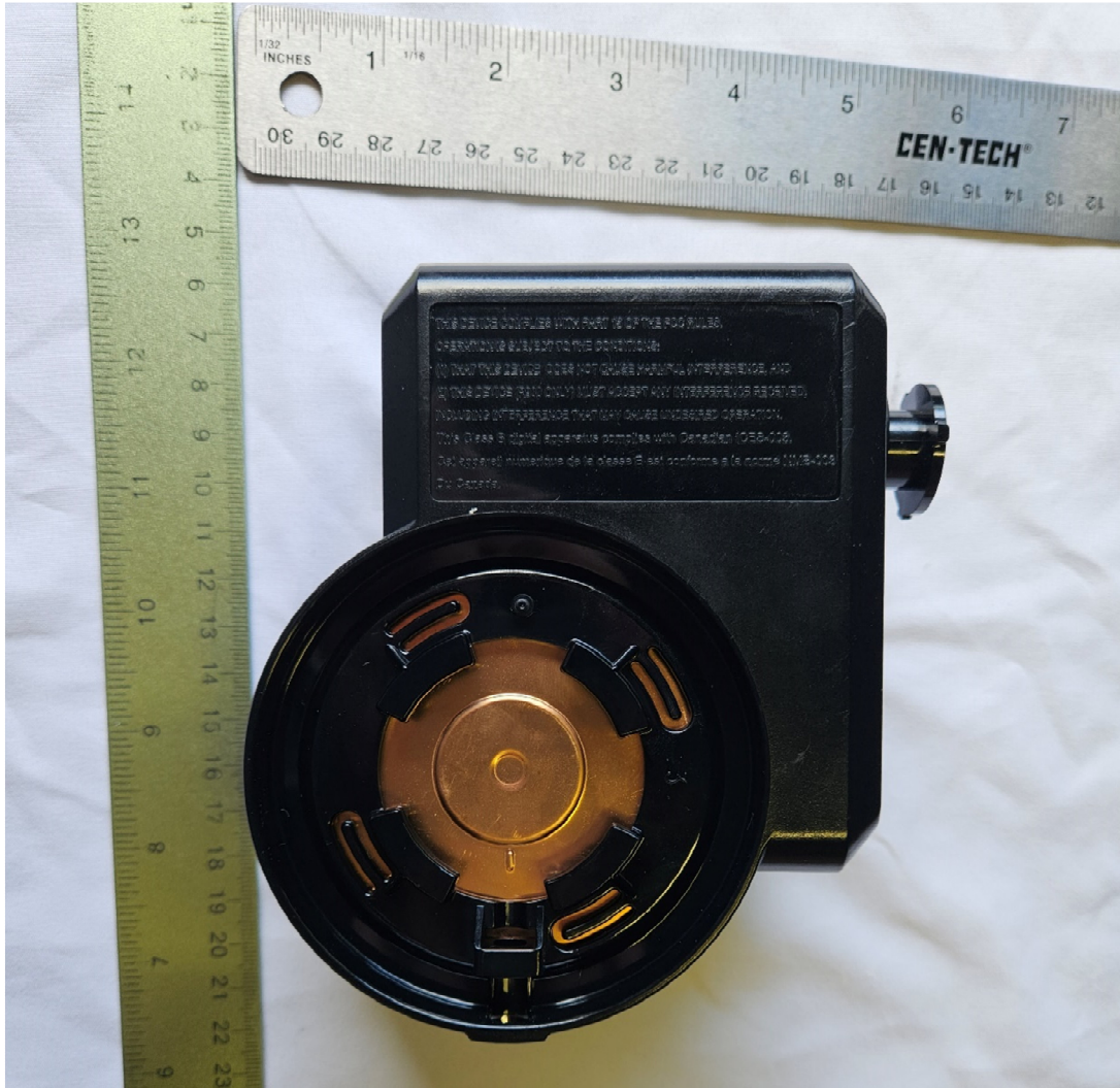
Figure 2. Bottom

FCC Part 15 Certification/ RSS 247 P2SR900CE 4171B-R900CE 23-0195 October 17, 2023 Neptune Technology Group Inc. R900