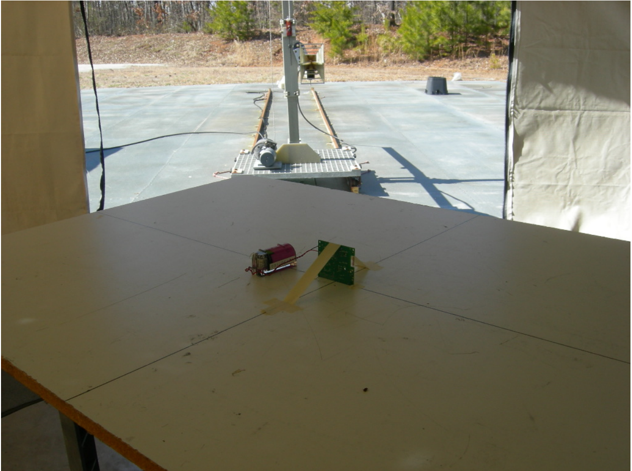
Figure 3: Radiated Emissions