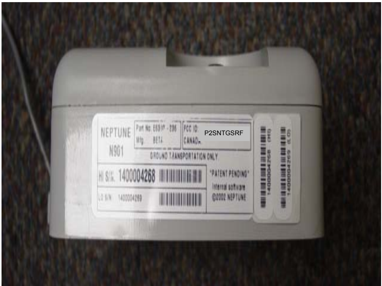
Figure 2: Label Location – Both Variants