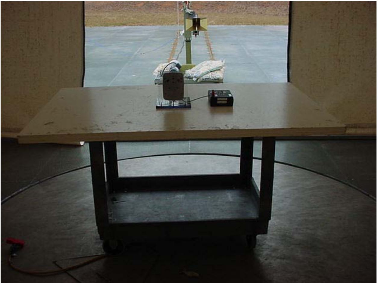
Figure 2: Wall Unit – Rear View