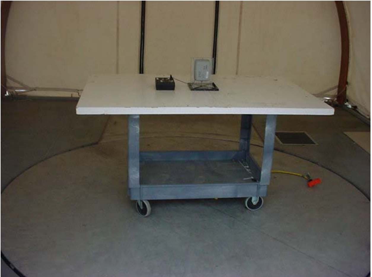
Figure 1: Wall Unit – Front View