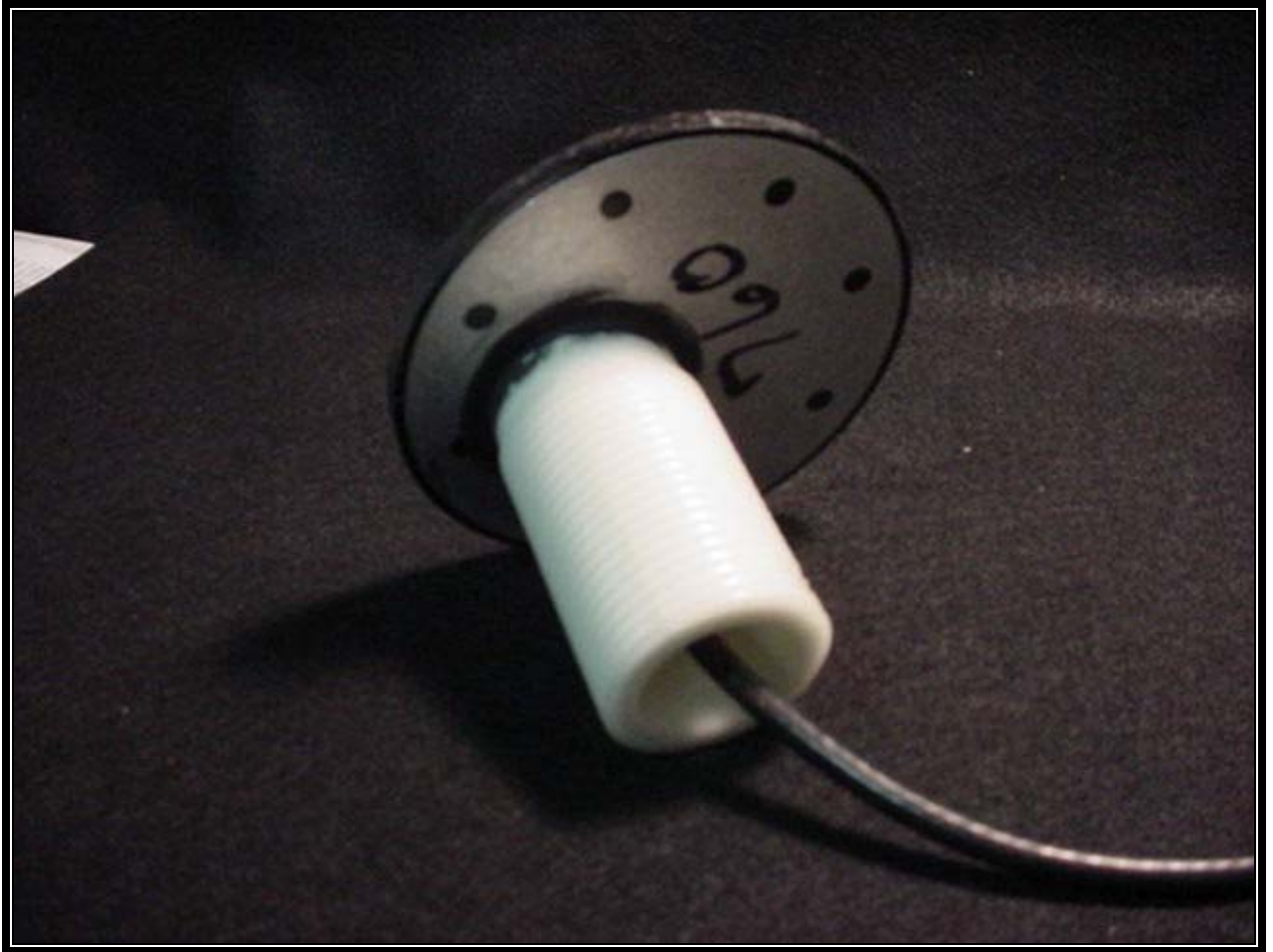
Figure B2: Pit Unit Antenna