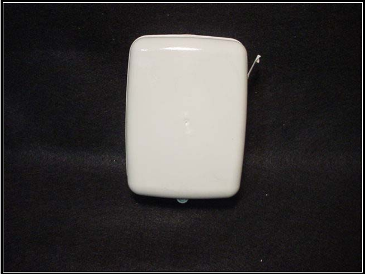
Figure B3: Wall Unit Front View