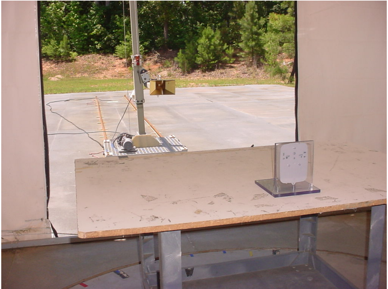
Figure 2: Radiated Emissions (Intentional)