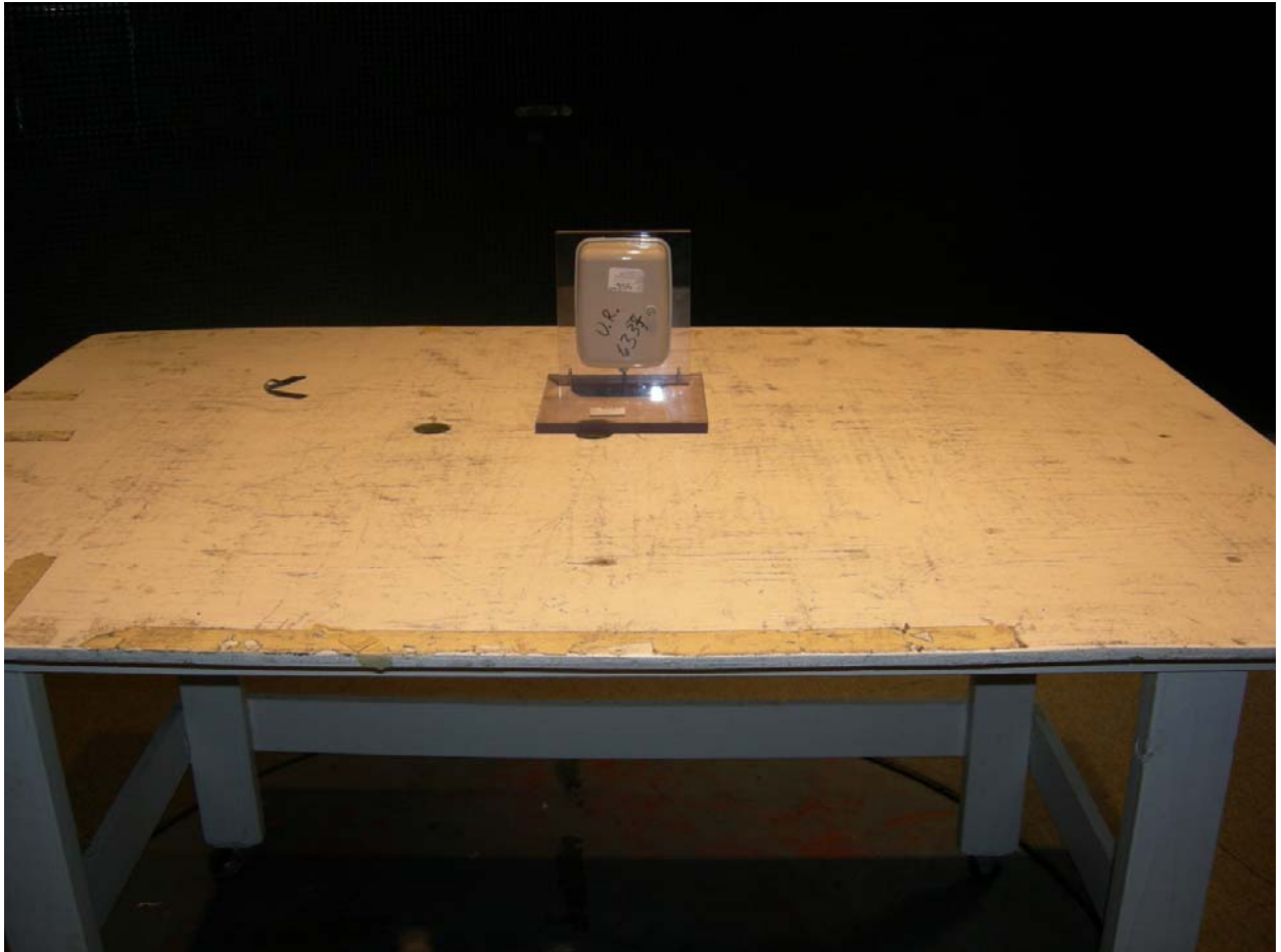
Figure 4: Radiated Emissions (Unintentional)