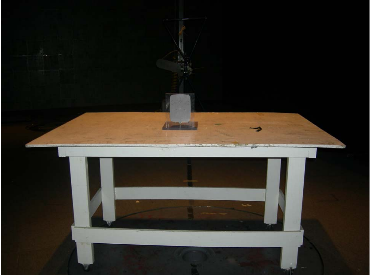
Figure 5: Radiated Emissions (Unintentional)