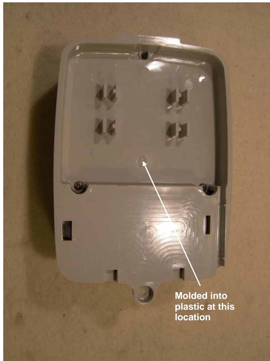
Figure 4: Label Location (Compliance Statement)