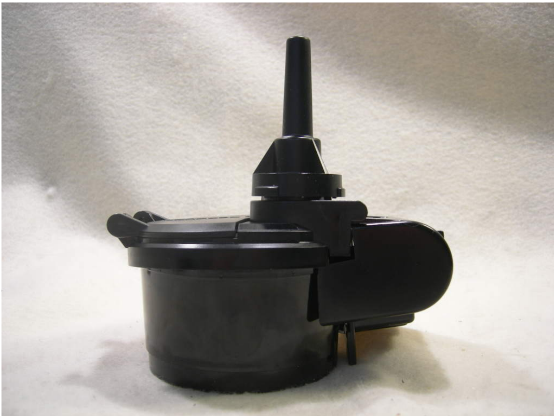
Figure 12: Slip On Pit Antenna - Side