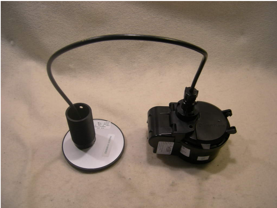
Figure 15: Lid Mount Pit Antenna