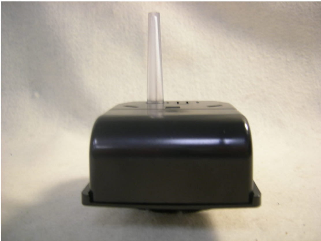
Figure 3: Wire Inside Antenna – Back