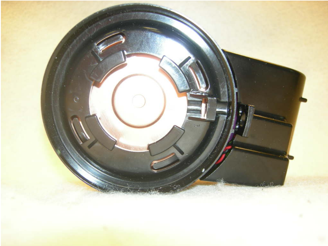
Figure 13: Slip On Pit Antenna - Bottom