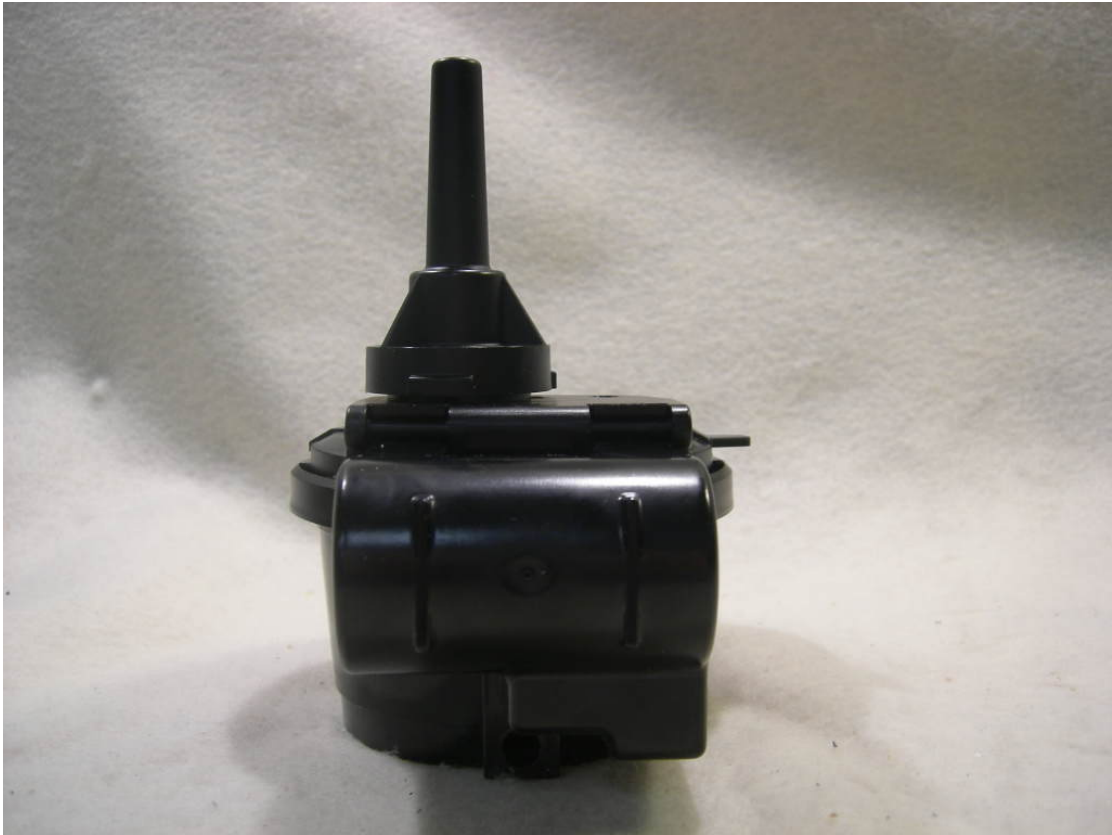
Figure 10: Slip On Pit Antenna - Back