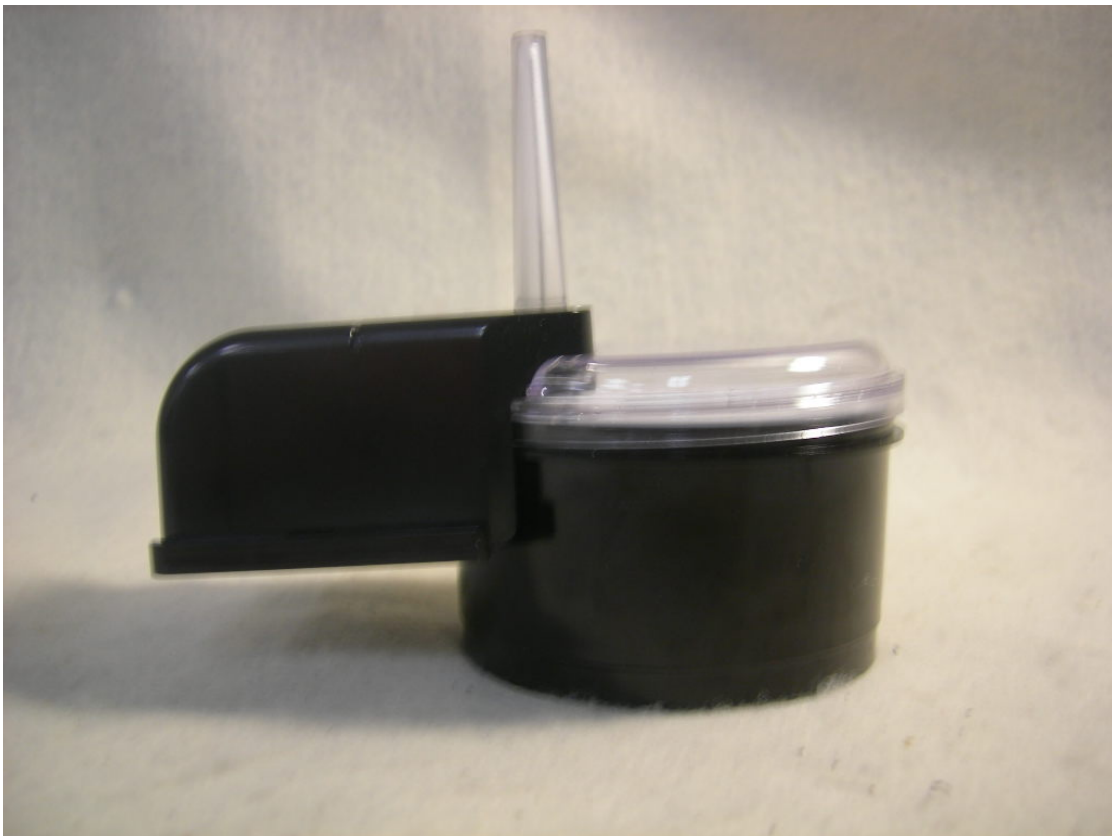
Figure 5: Wire Inside Antenna – Side