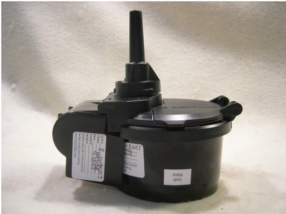
Figure 11: Slip On Pit Antenna - Side