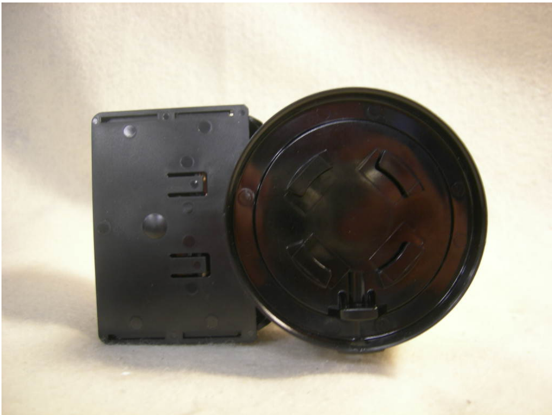
Figure 6: Wire Inside Antenna - Bottom