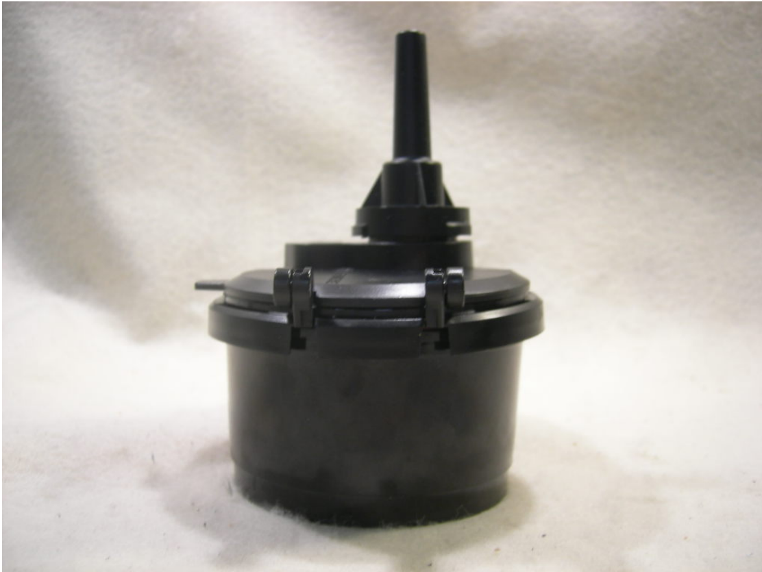
Figure 9: Slip On Pit Antenna - Front