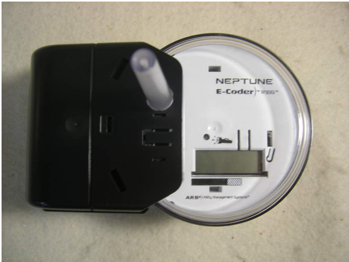
Figure 1: Wire Inside Antenna – Top