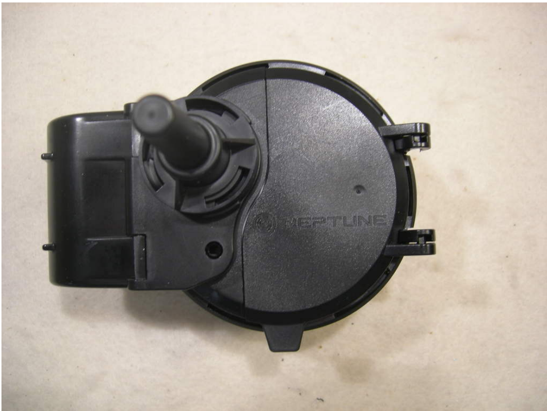
Figure 8: Slip On Pit Antenna - Top