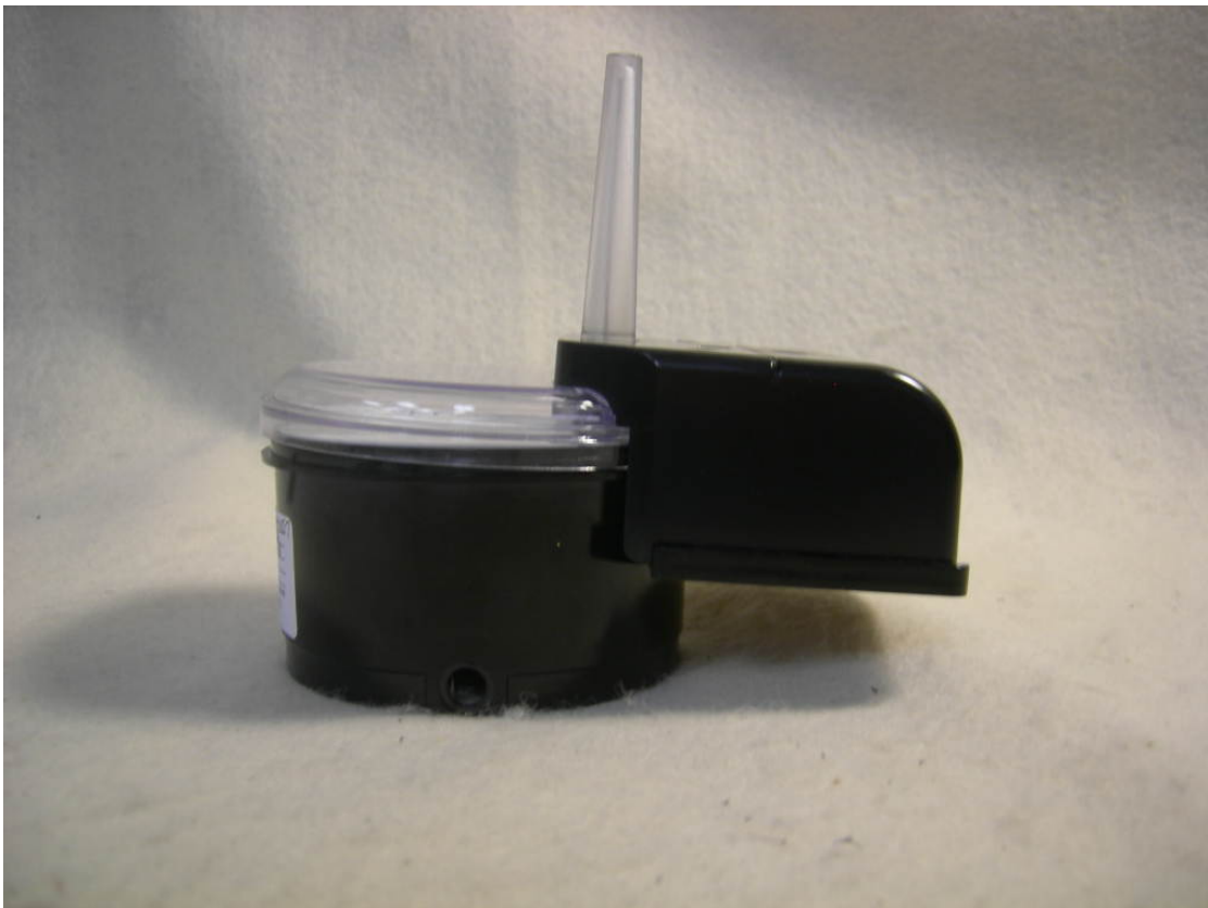
Figure 4: Wire Inside Antenna – Side