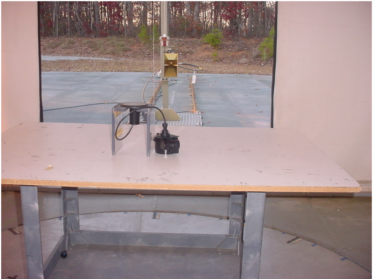
Figure 3: Test Setup – Radiated Emissions – Pit Patch Antenna