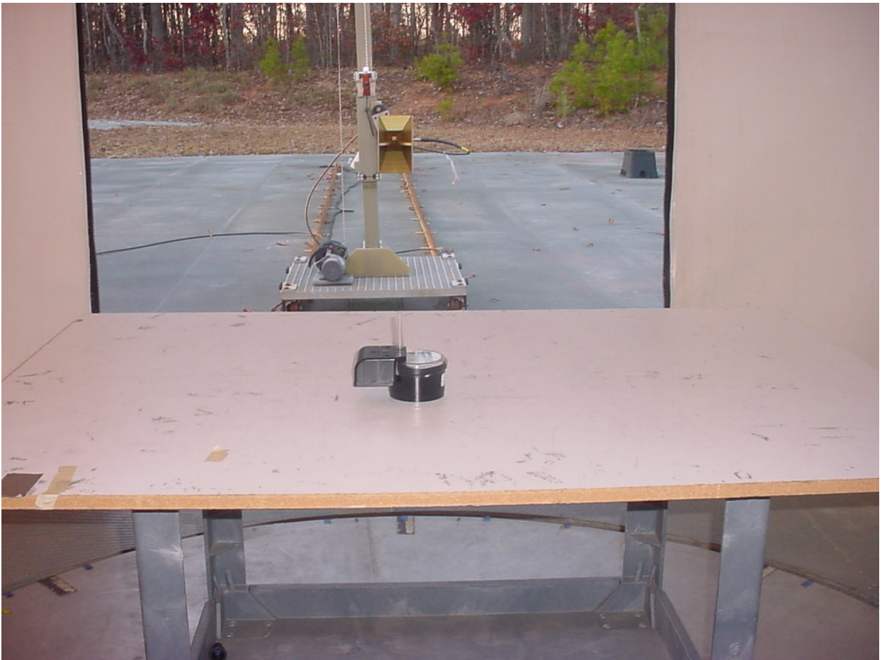
Figure 1: Test Setup – Radiated Emissions - Basement Monopole Antenna