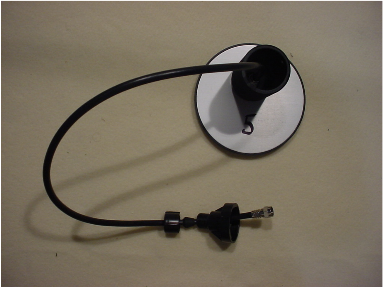
Figure 5: External – Patch Antenna Assembly Bottom View