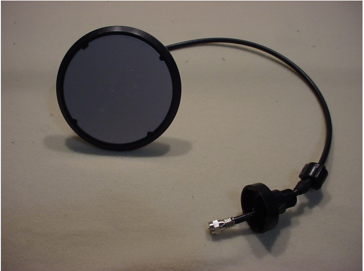
Figure 6: External – Patch Antenna Assembly Top View