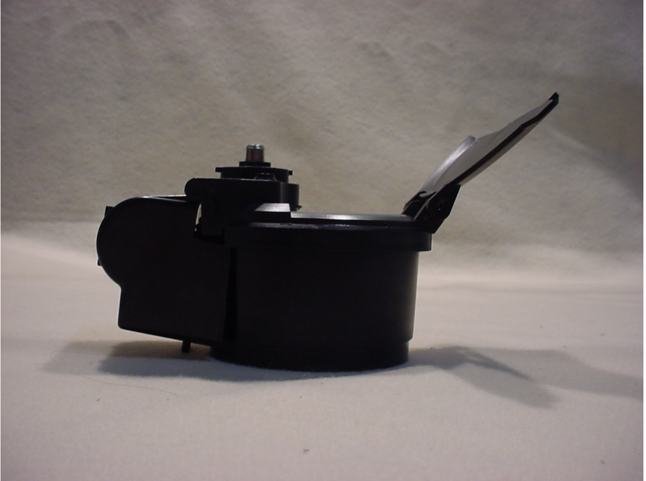
Figure 3: External – Side View