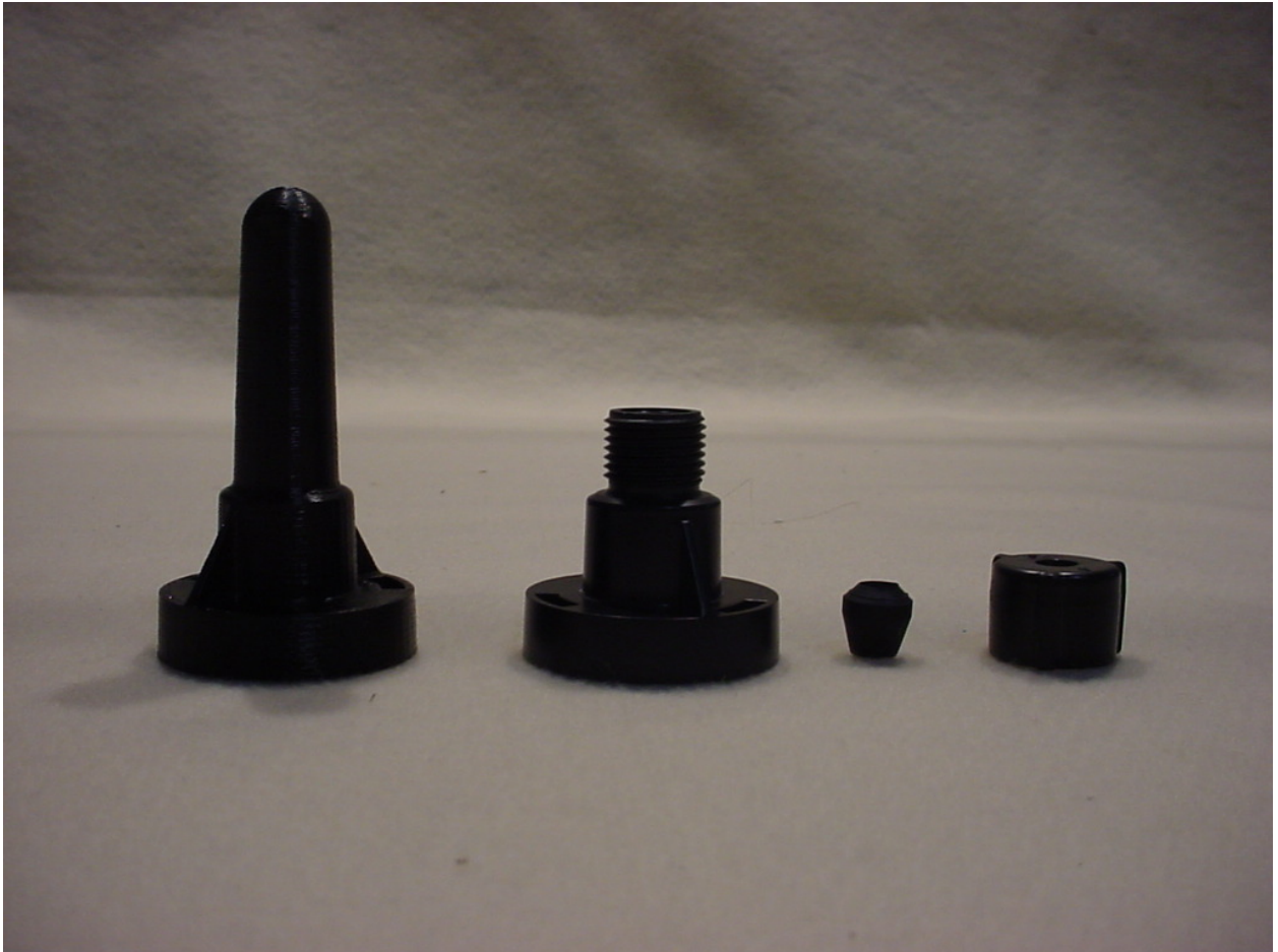
Figure 7: External – Antenna Assembly Connectors and Gasket