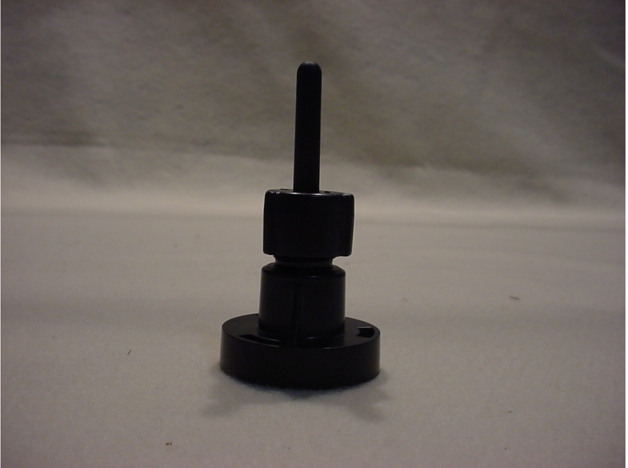
Figure 4: External – Monopole Antenna Assembly