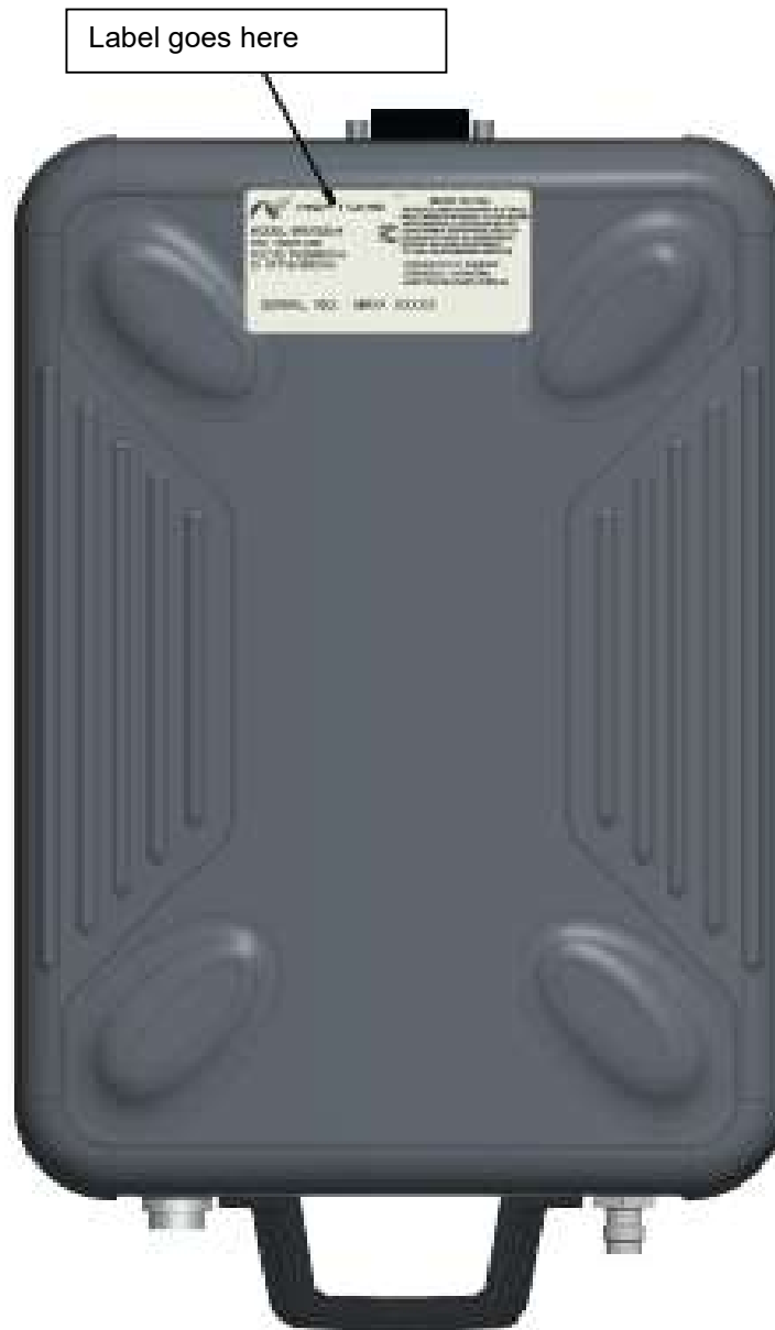
Figure 1. Rendering of Label Location on EUT