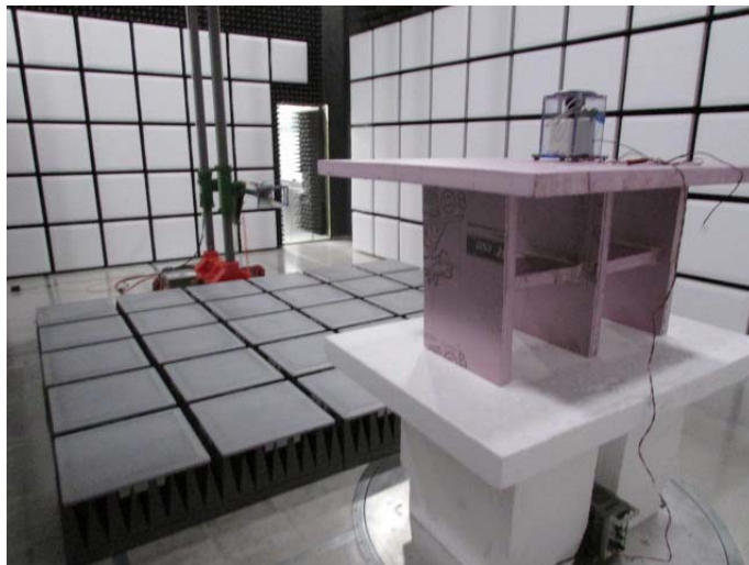
Figure 2: Radiated Spurious Emissions – Rear View – Above 1GHz