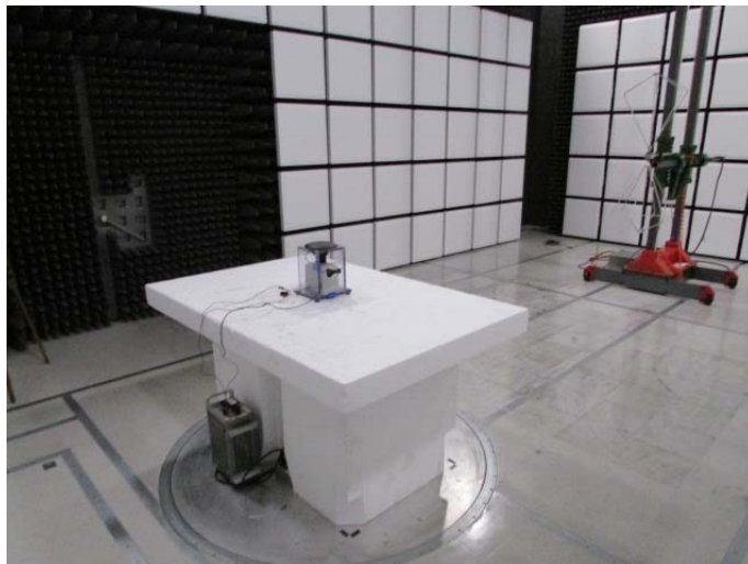
Figure 4: Radiated Spurious Emissions – Rear View – Below 1GHz