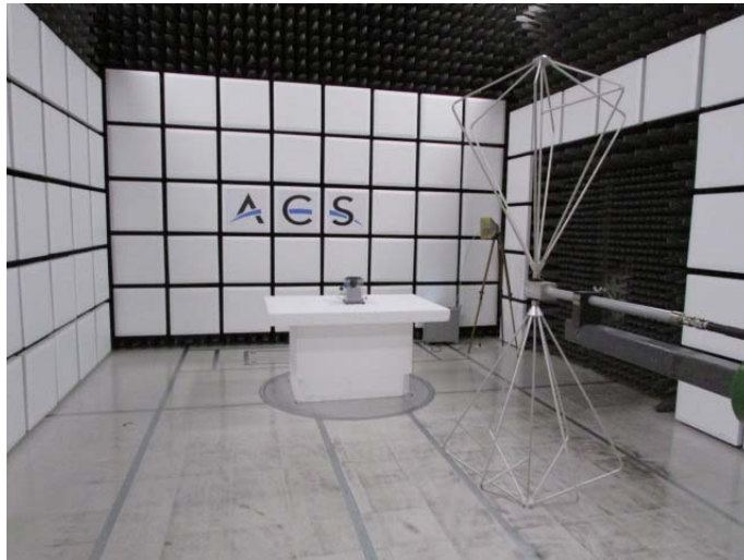
Figure 3: Radiated Spurious Emissions – Front View – Below 1GHz