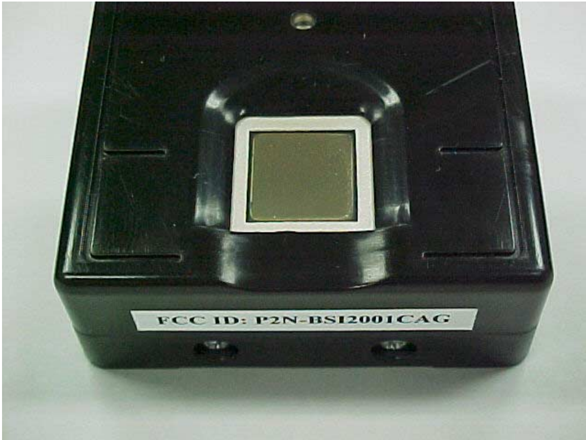
Photo Two Front Cover close-up of Finger Scanner FCC ID Label visible

Biocentric Solutions Incorporated Contactless GuardDog FCC ID#: P2N-BSI2001CAG