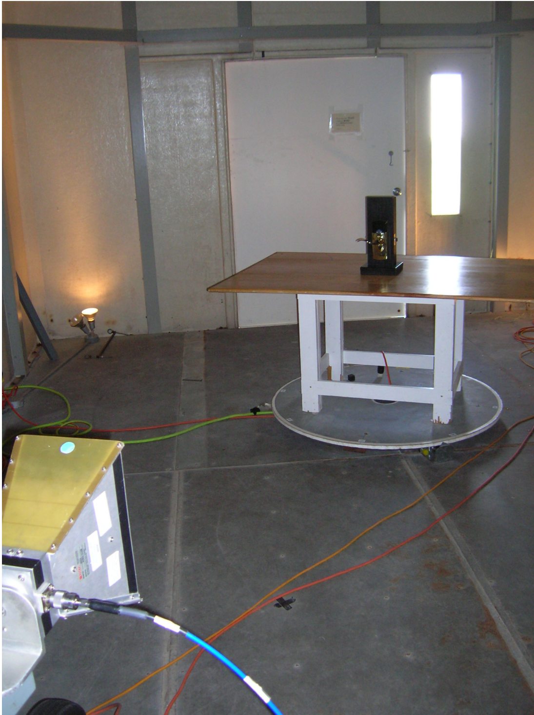
High Frequency Spurious Emissions, Fundamental