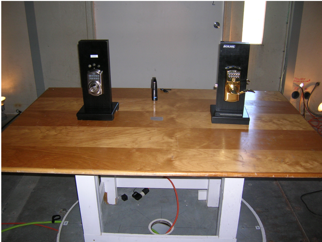
Spurious Emissions 30-1000MHz