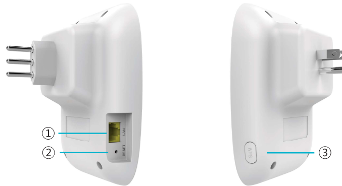
Figure 2: Side Panel