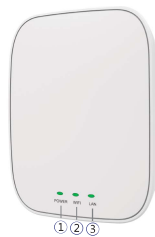
Figure 1: Front Panel