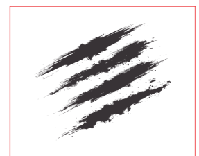
Silkscreen printing Pantone Red 485C