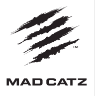
Silkscreen printing Pantone White C