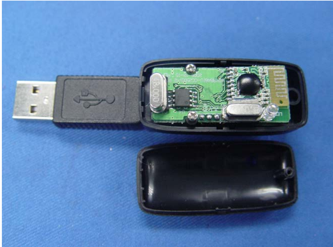
Figure 6 Main Board, Component Side