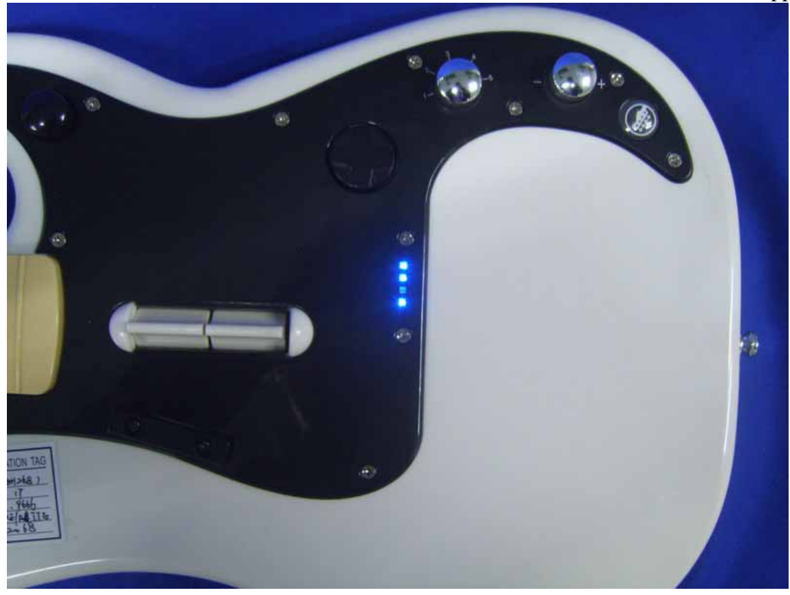
Figure 5 General Appearance