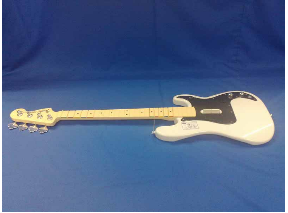
Figure 2 General Appearance