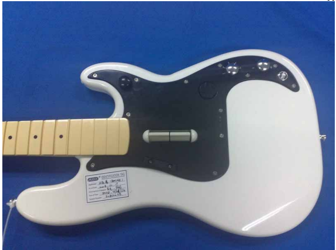
Figure 4 General Appearance