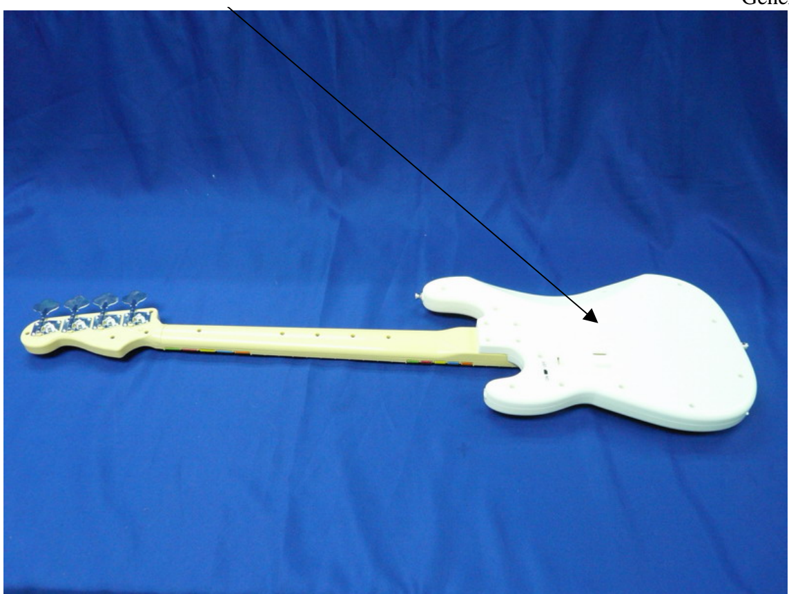
Figure 2 General Appearance