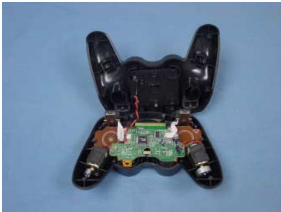
Figure 7 Main Board, Component Side