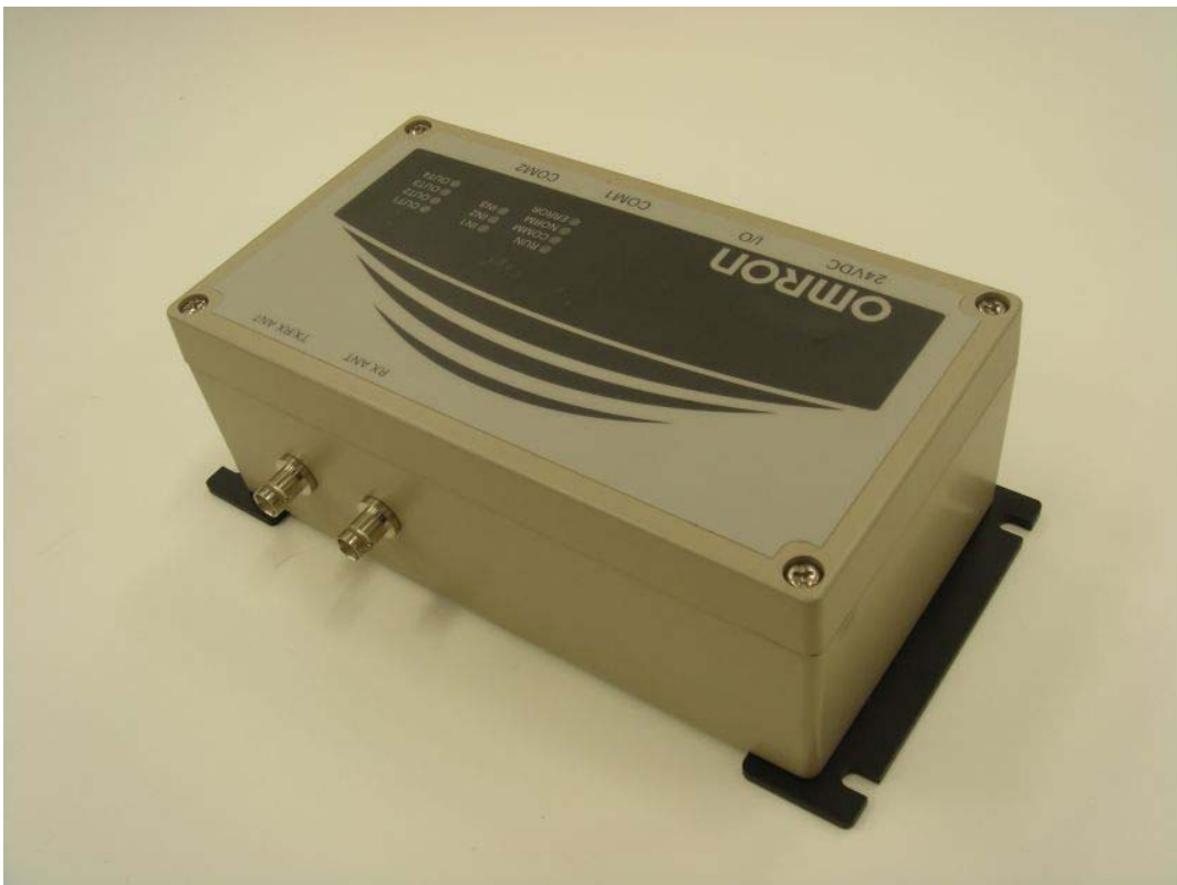
Overview (Left top)