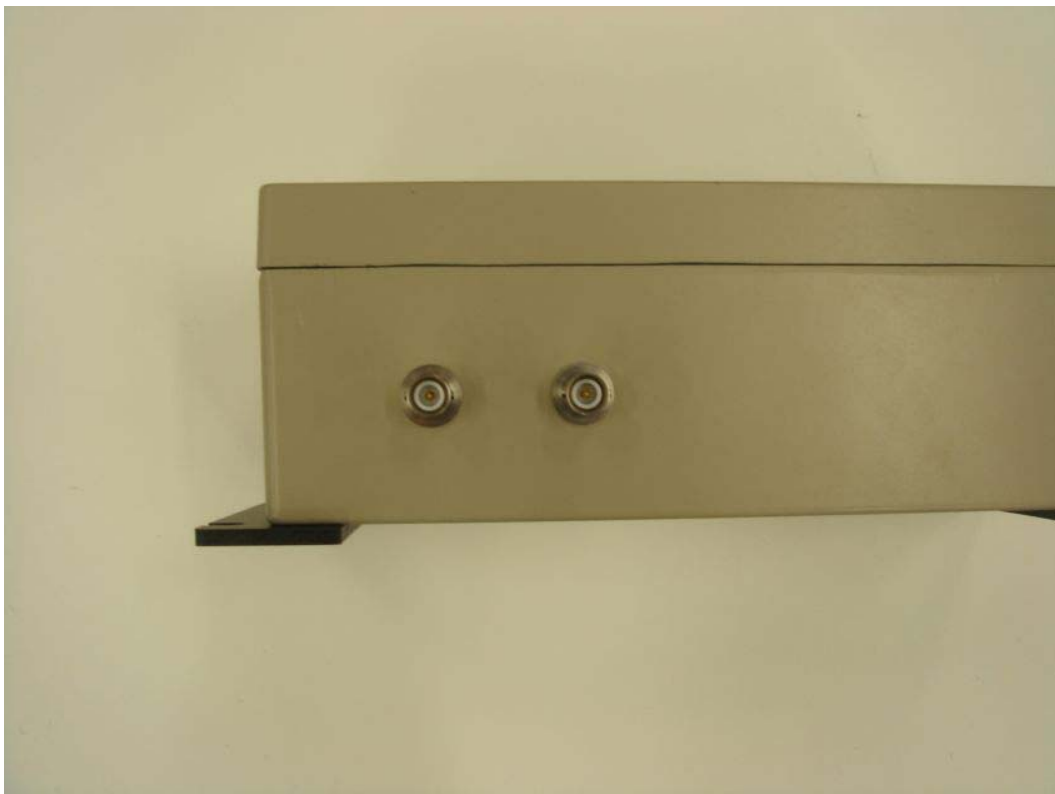
Front (Antenna Connector part)