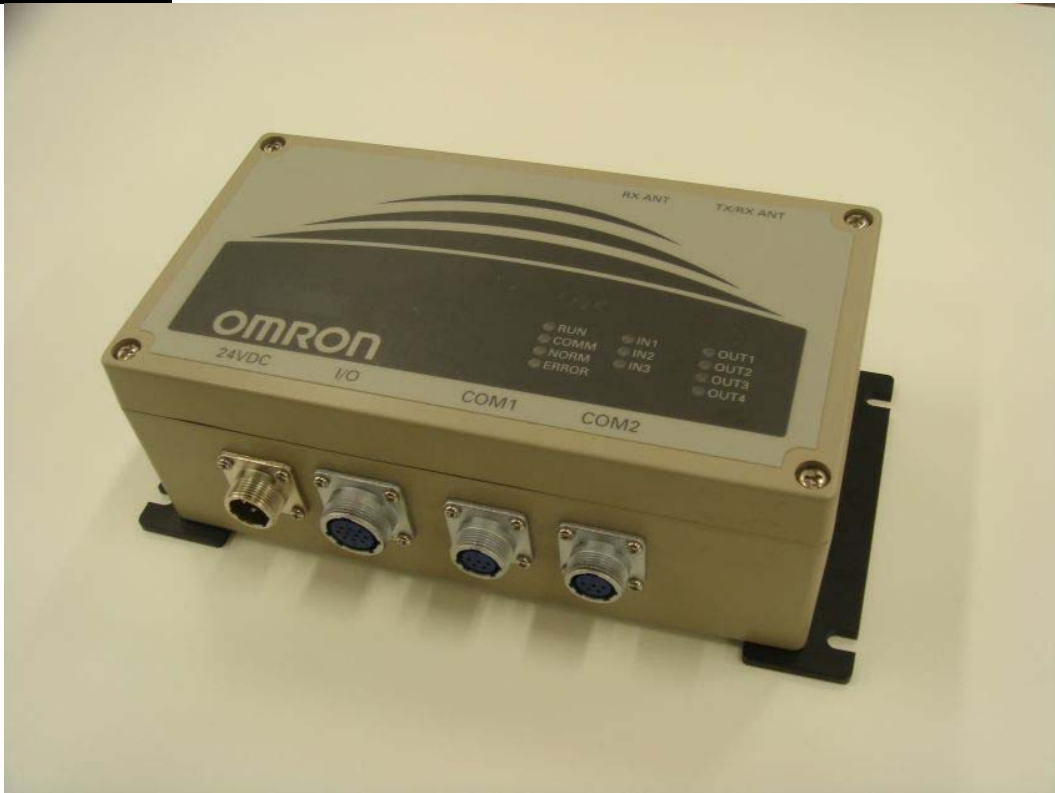
Overview (Right bottom)