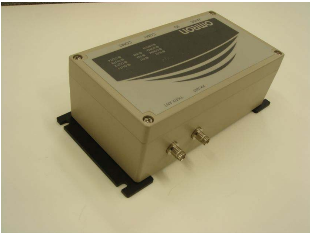
Overview (Right top)