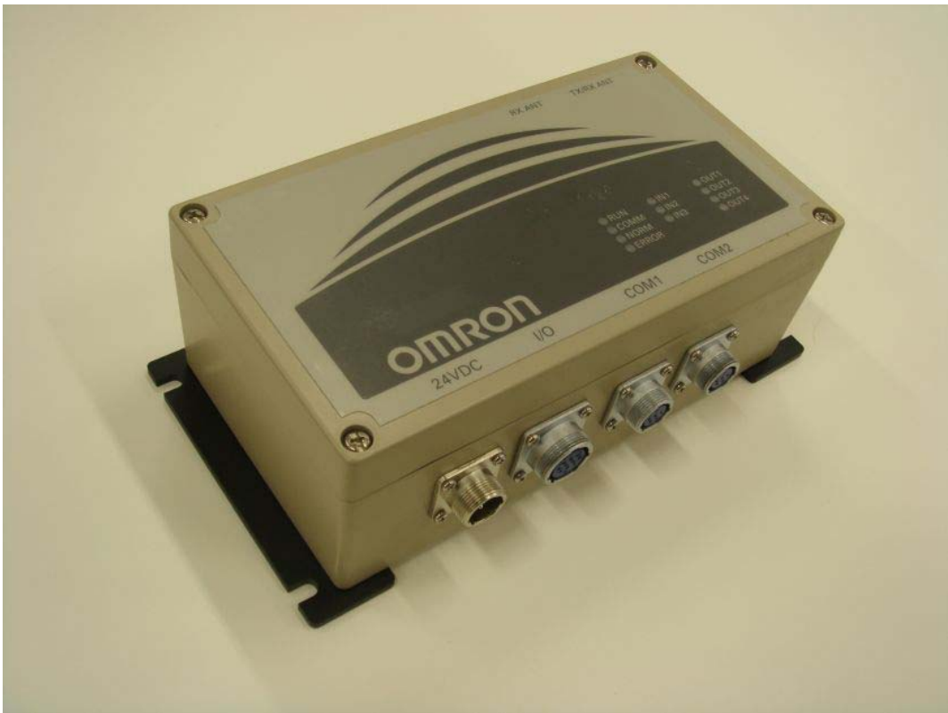
Overview (Left bottom)