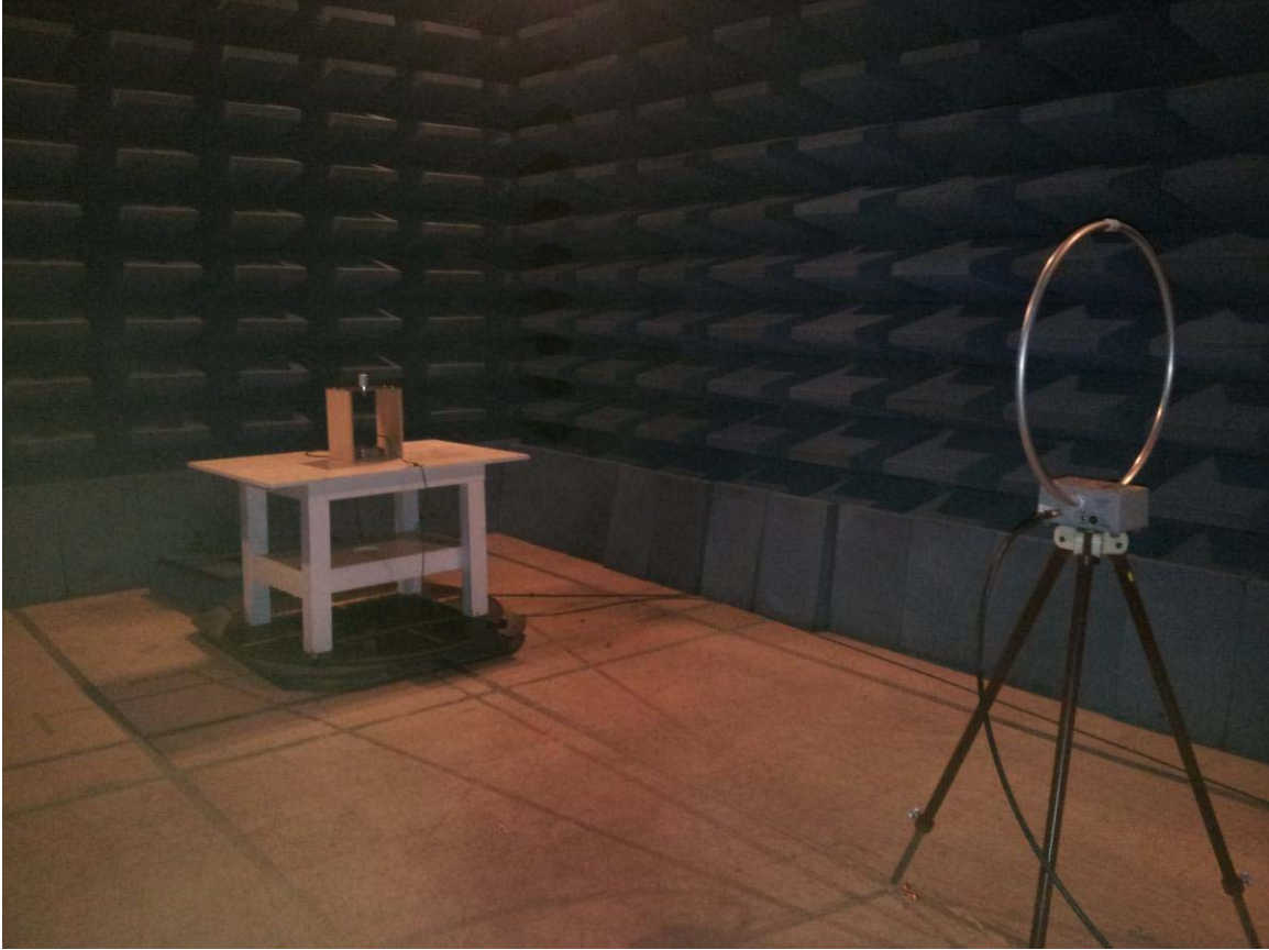
Emissions Test Setup – Intentional/Unintentional Radiated Emissions 0.009 – 30 MHz