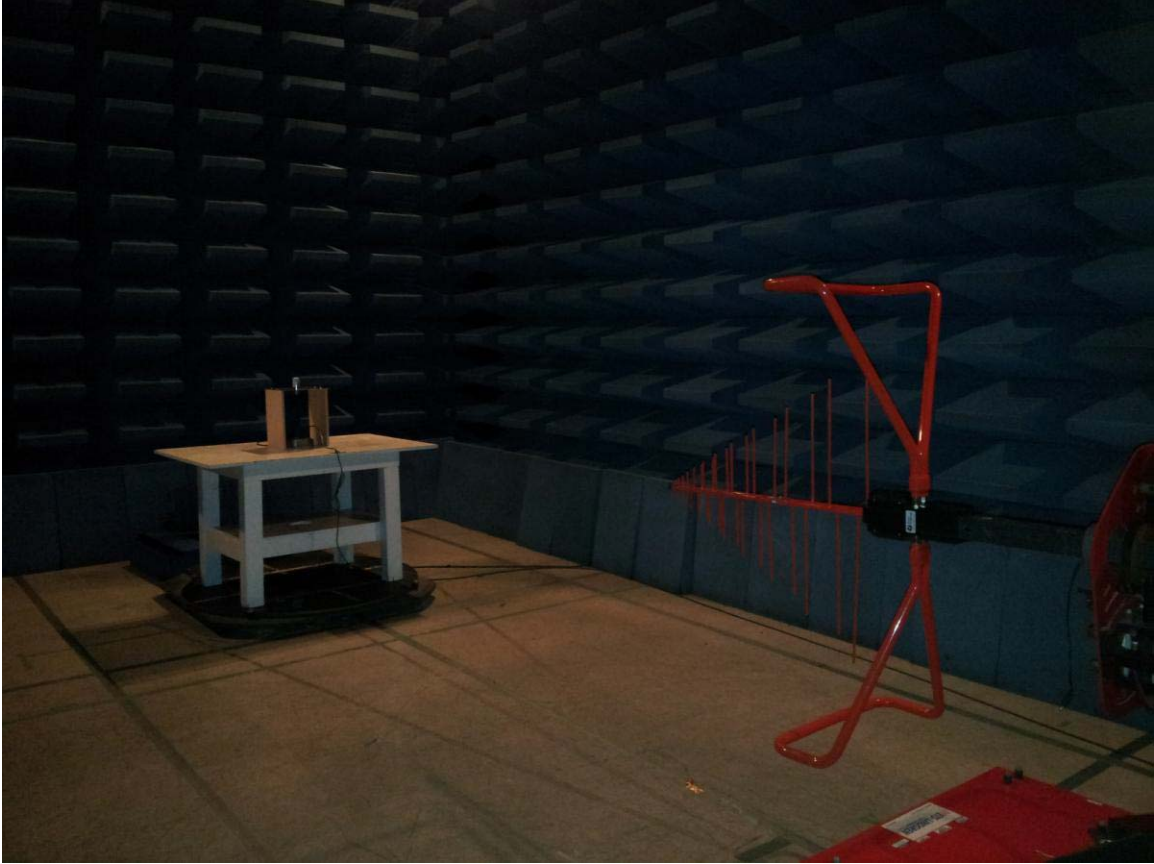
Emissions Test Setup – Intentional/Unintentional Radiated Emissions 30 – 1000 MHz