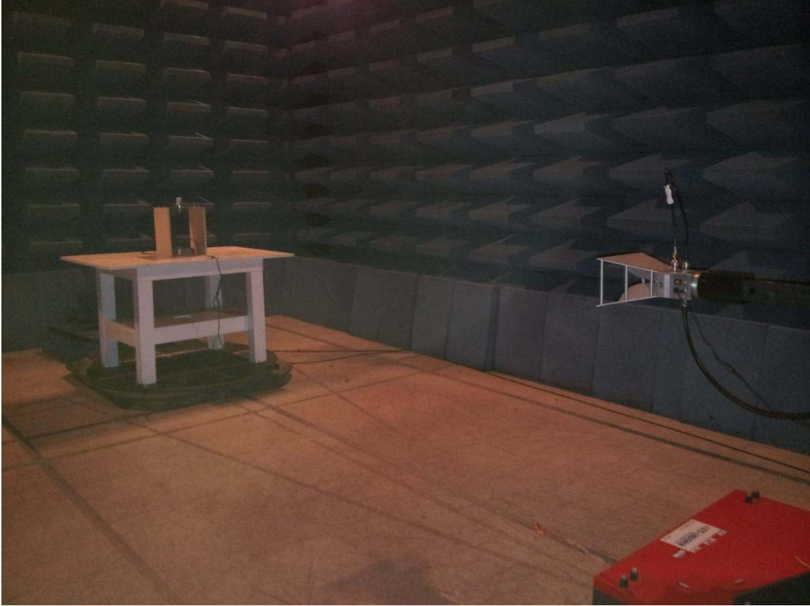
Emissions Test Setup – Intentional/Unintentional Radiated Emissions 1000 - 10000 MHz