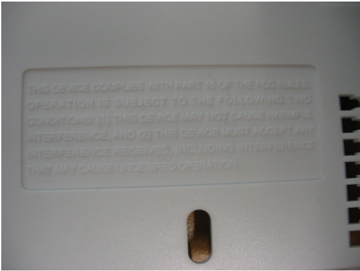
Back View – Zoom up of Statement of Compliance