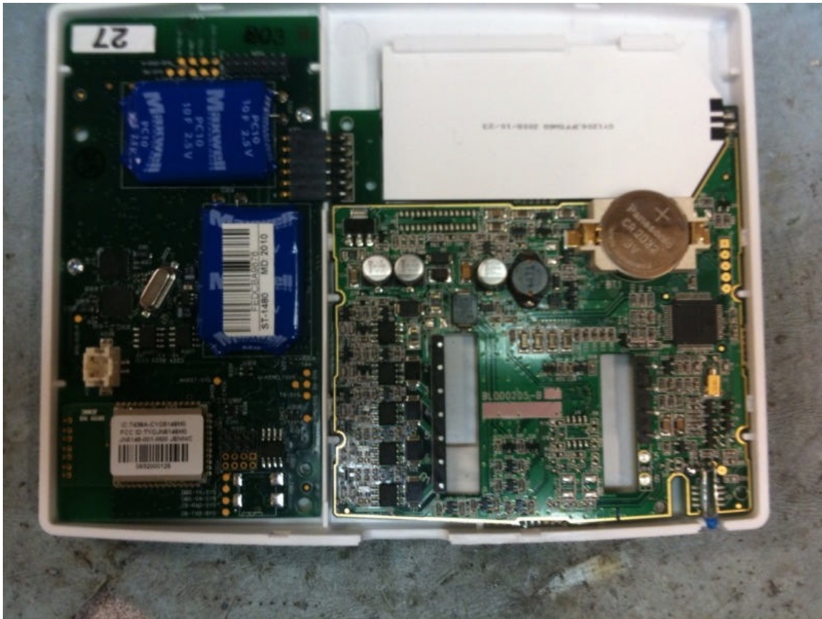
View of inside with plastic cover removed.