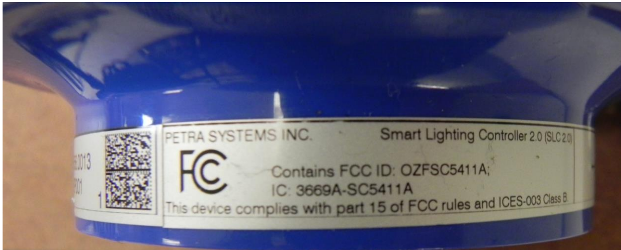
Host Label without carrier current operation (no PLC) (FCC Info)