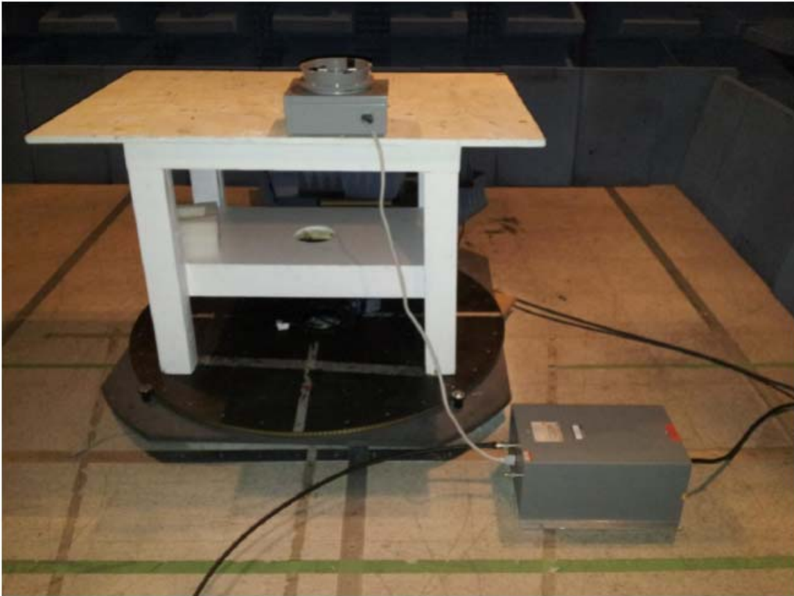
AC Conducted Test Setup