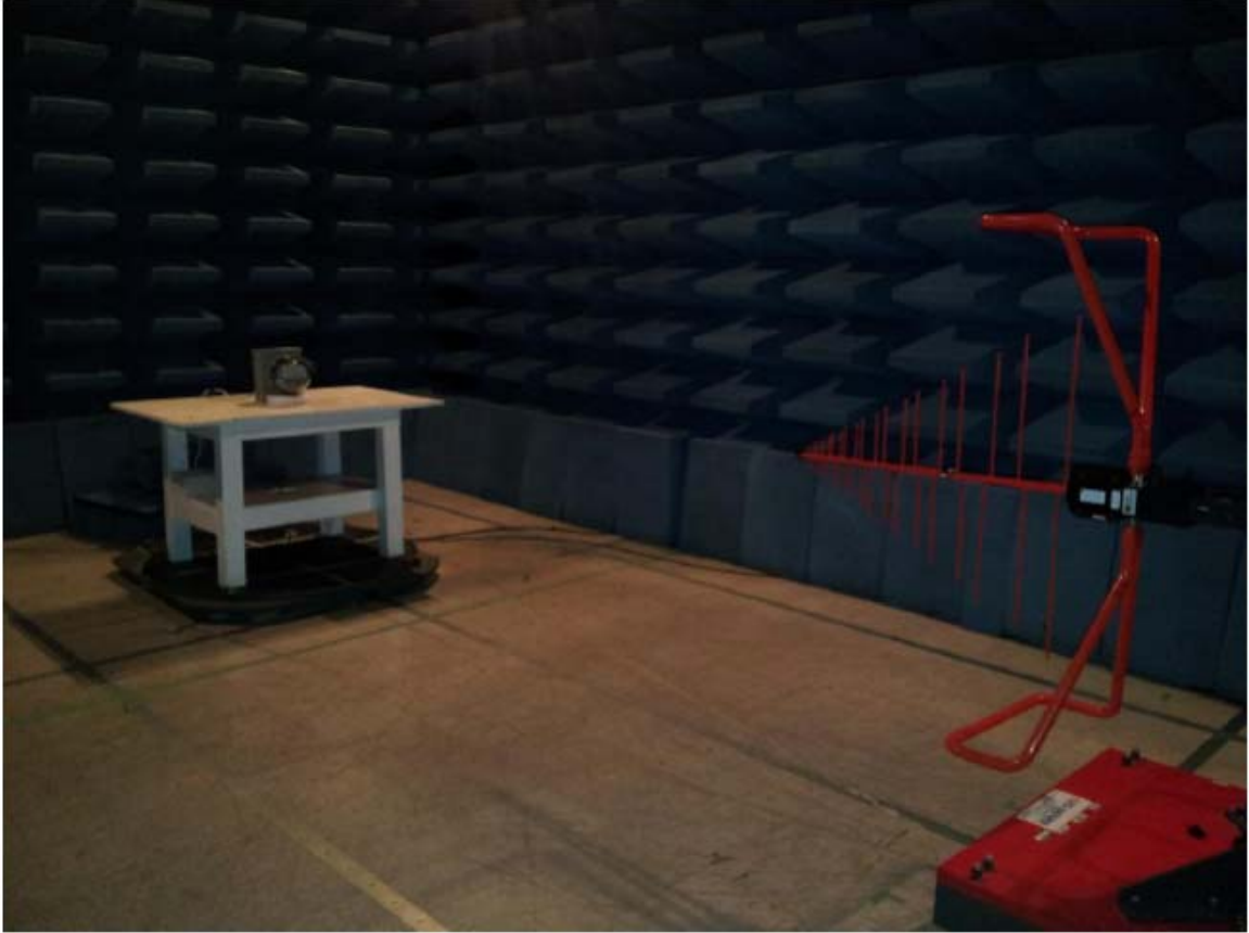
Emissions Test Setup – Intentional/Unintentional Radiated Emissions 30 – 1000 MHz