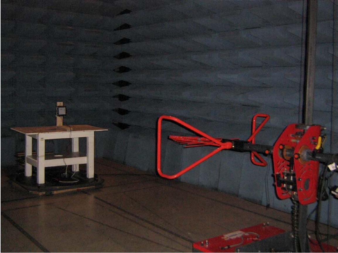
Emissions Test Setup – Intentional Radiated Emissions – EIRP 902-928 MHz