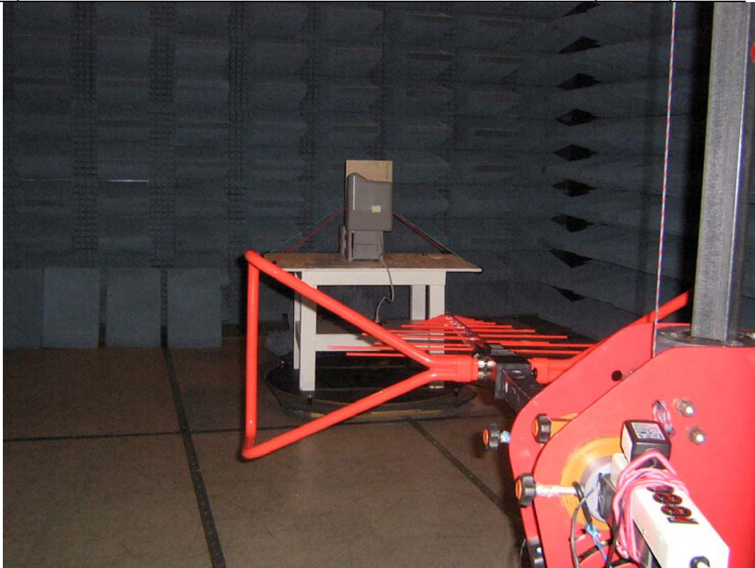
Intentional / Unintentional Radiated Emission 30 – 1000 MHz setup