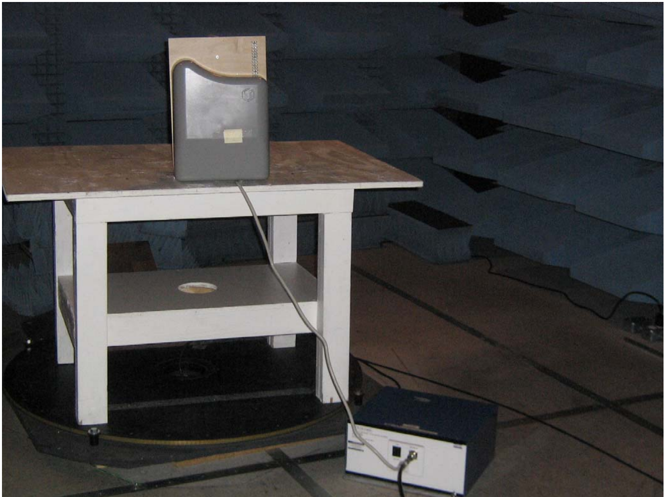
AC Conducted Test Setup