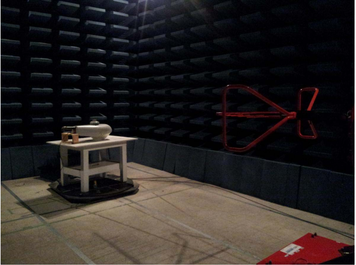
Emissions Test Setup – Intentional/Unintentional Radiated Emissions 30 – 1000 MHz