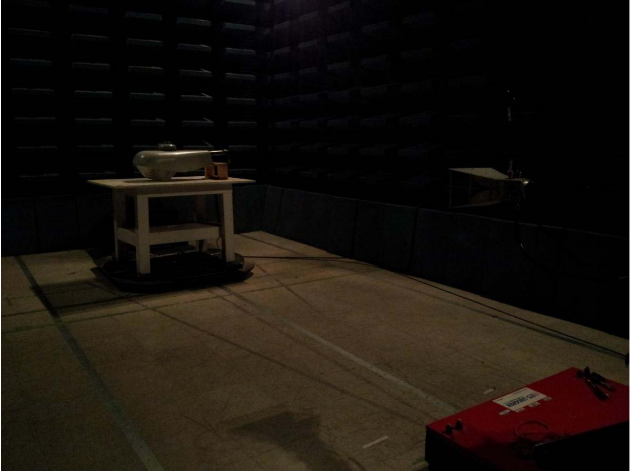
Emissions Test Setup – Intentional/Unintentional Radiated Emissions 1000 - 10000 MHz