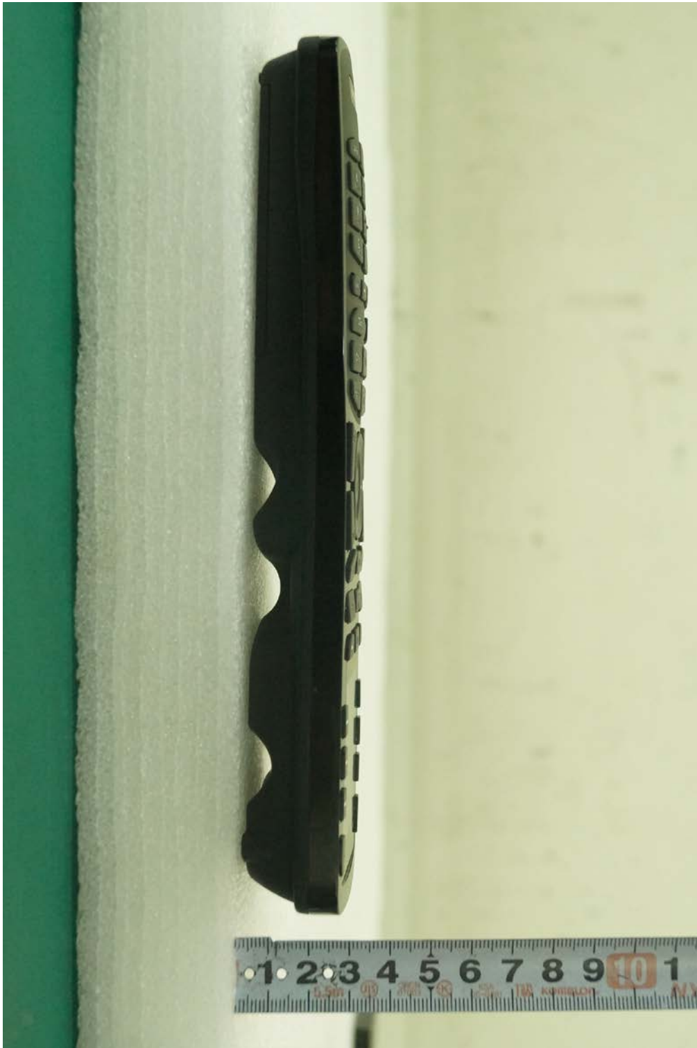
< Left side view >