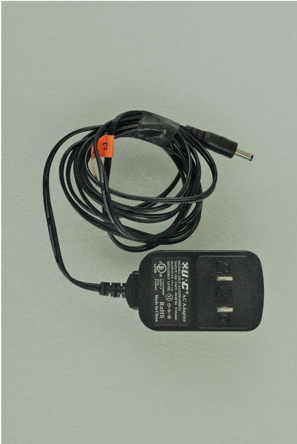
< AC/DC Adaptor >