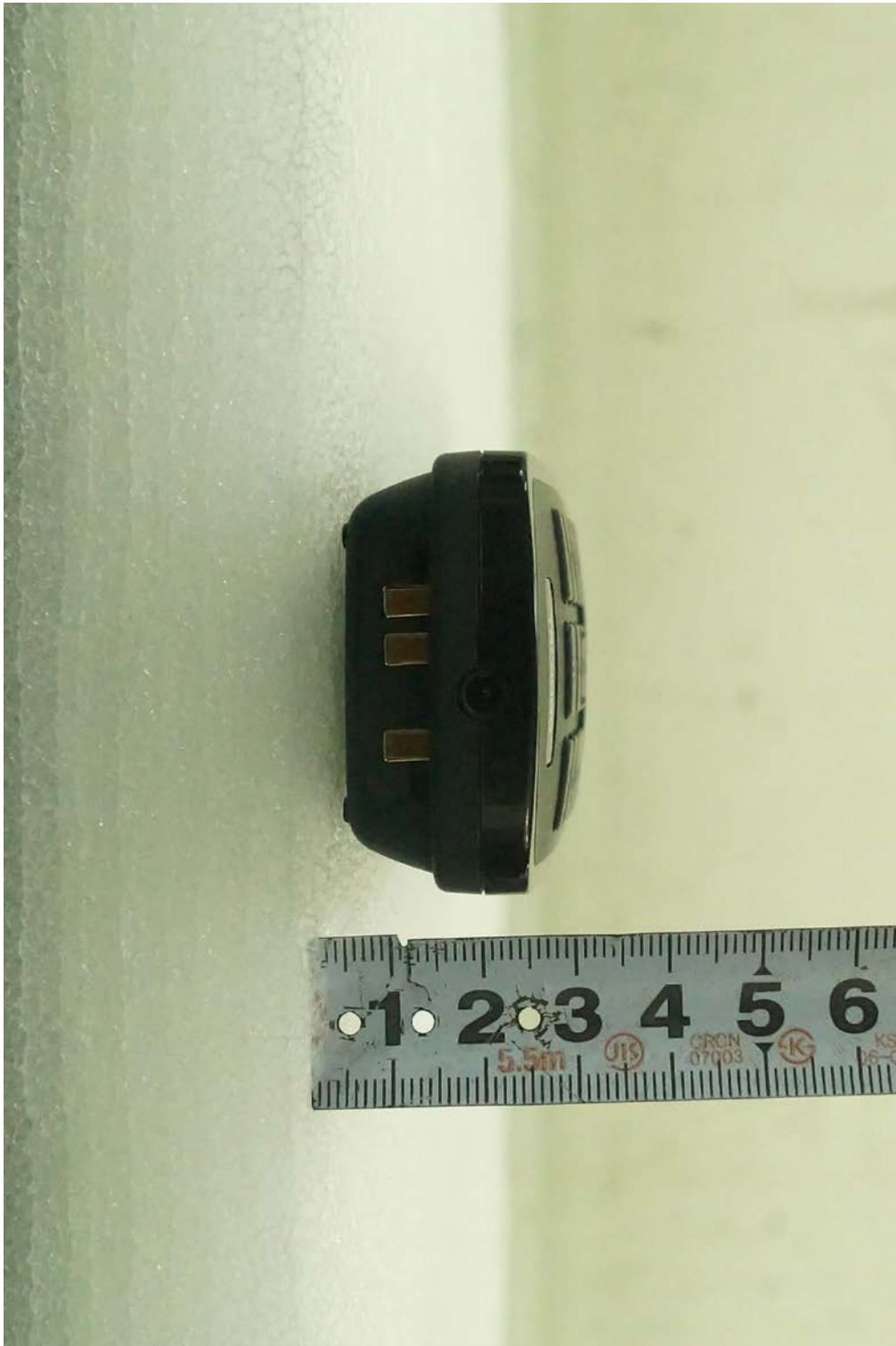
< Rear view >