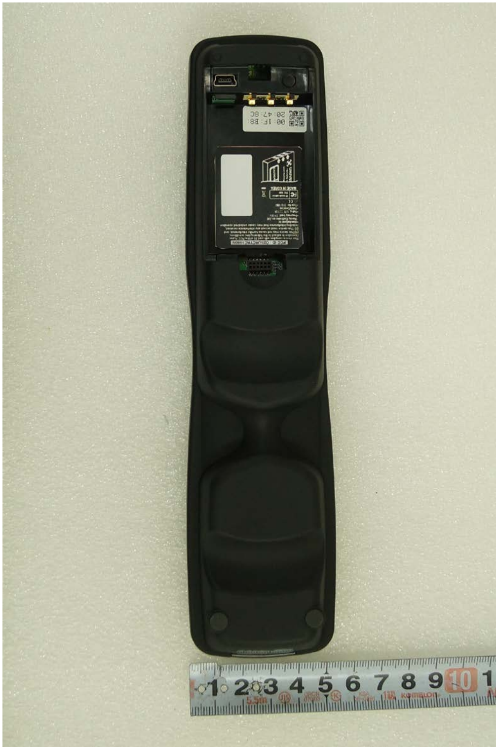
< Bottom without battery covers view >