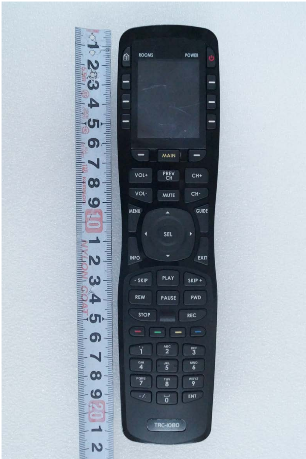
< Top view >