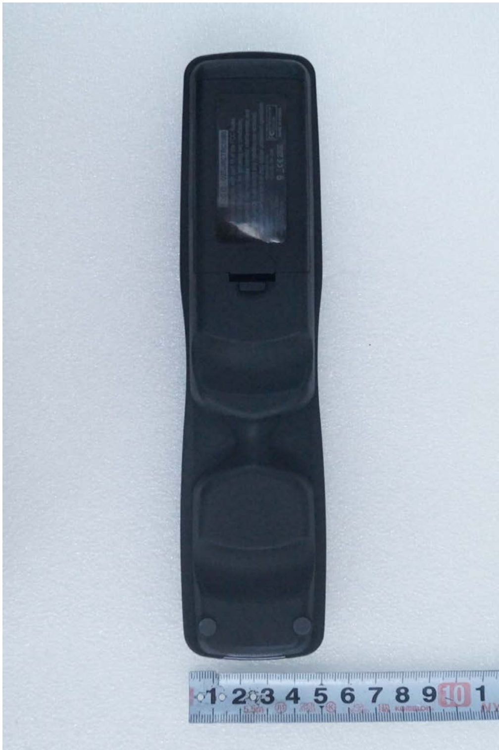
< Bottom view >