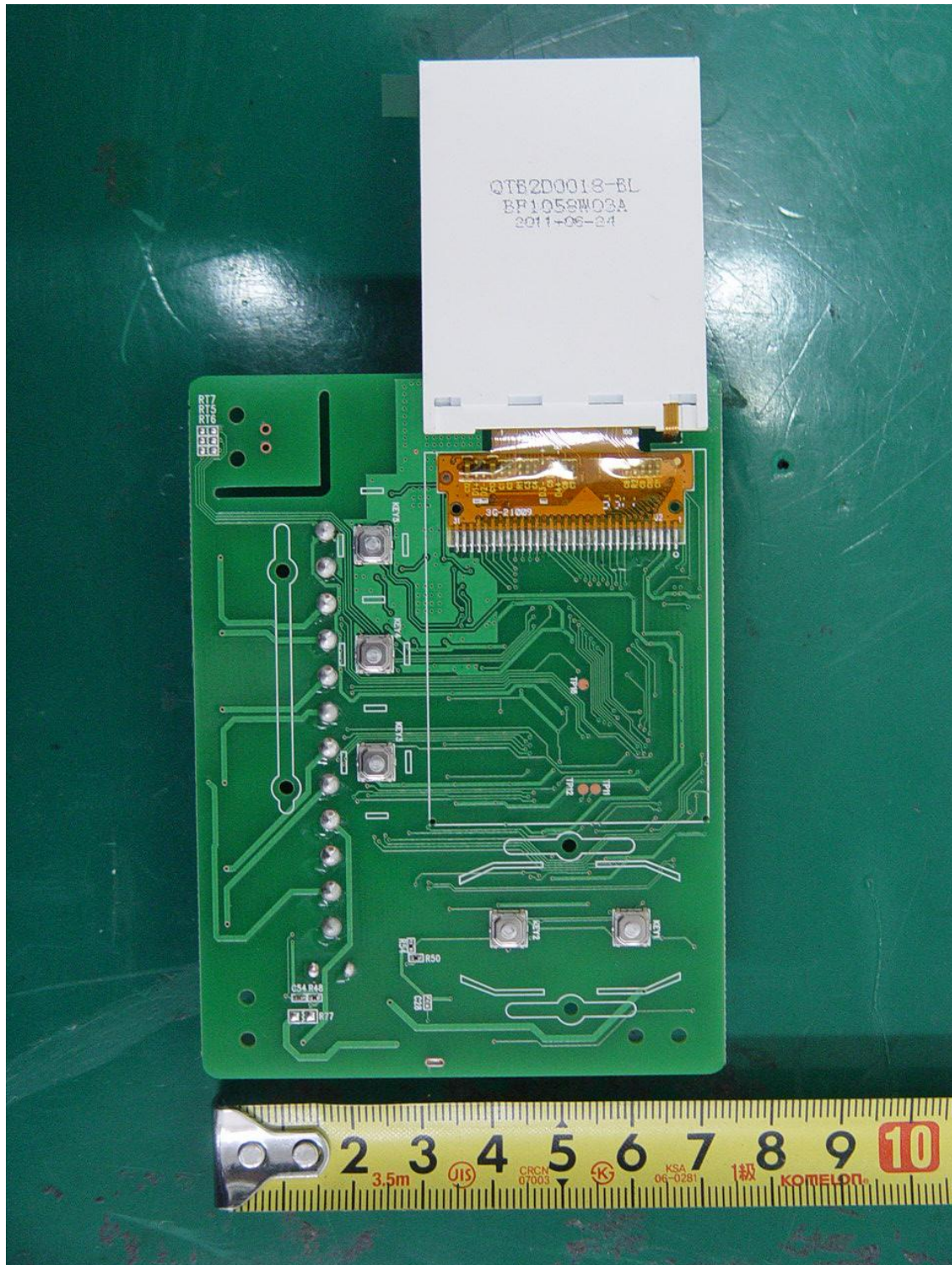
< Main board front #2 >