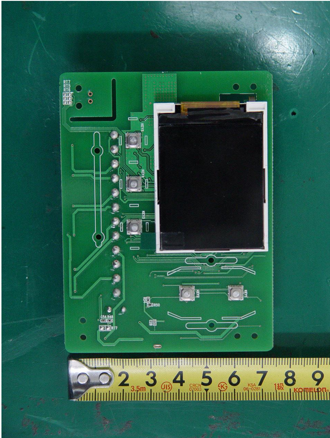
< Main board front #1 >