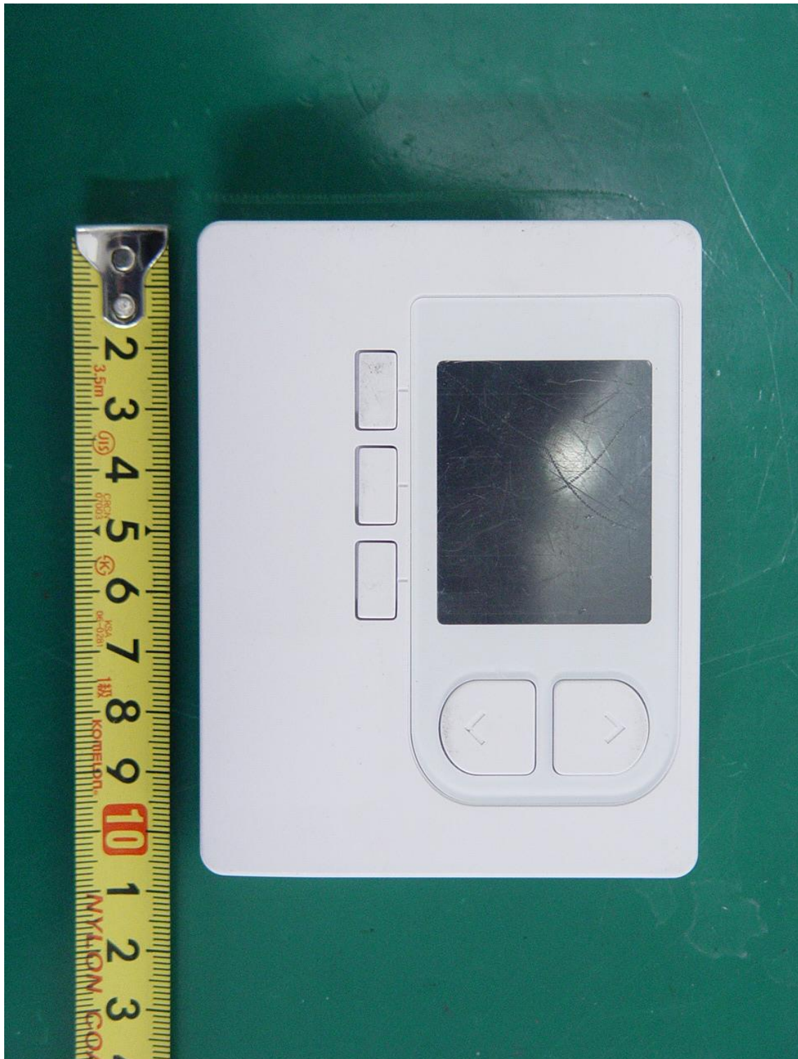
< Front >