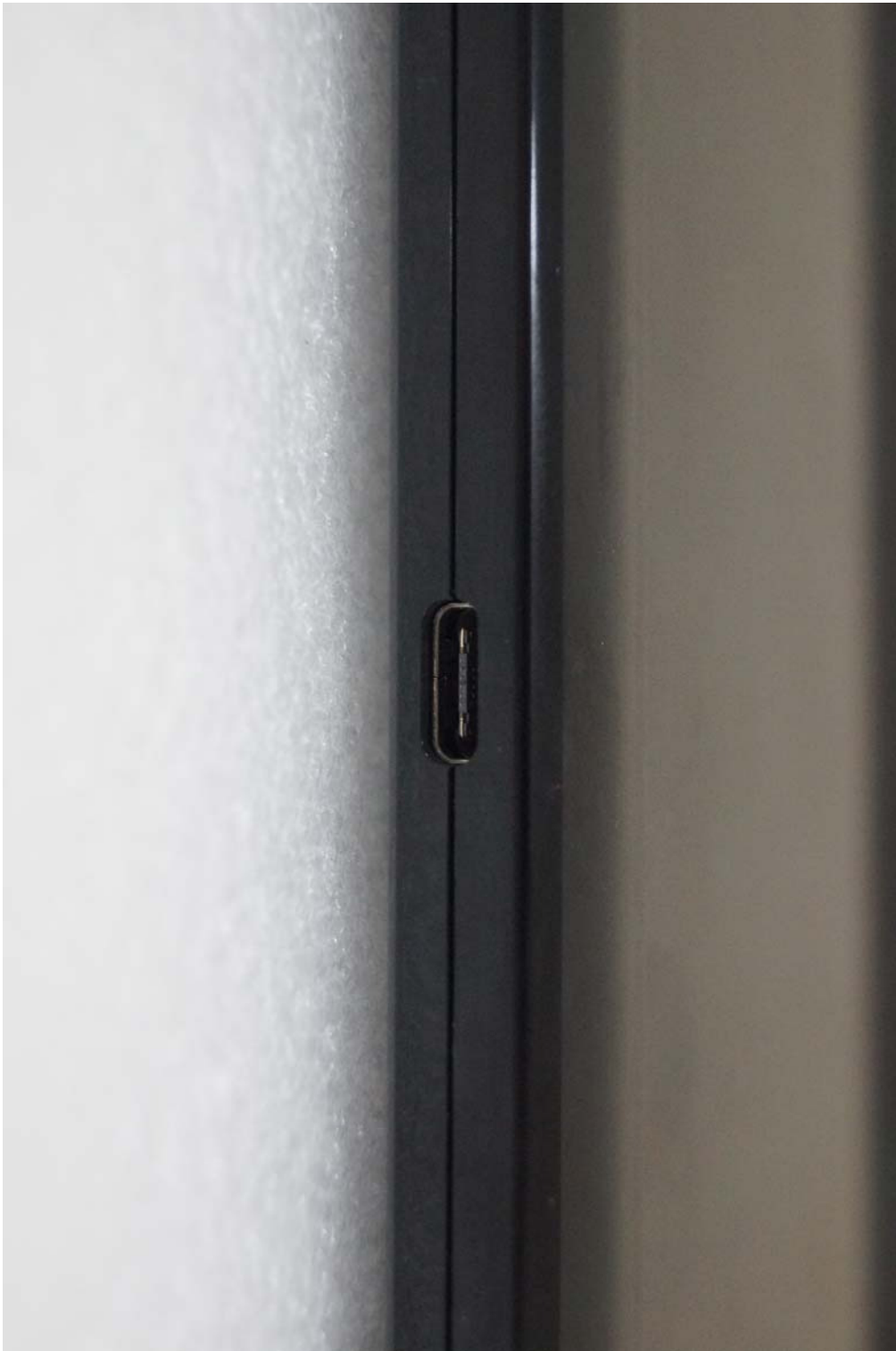
< Rear I/O port >