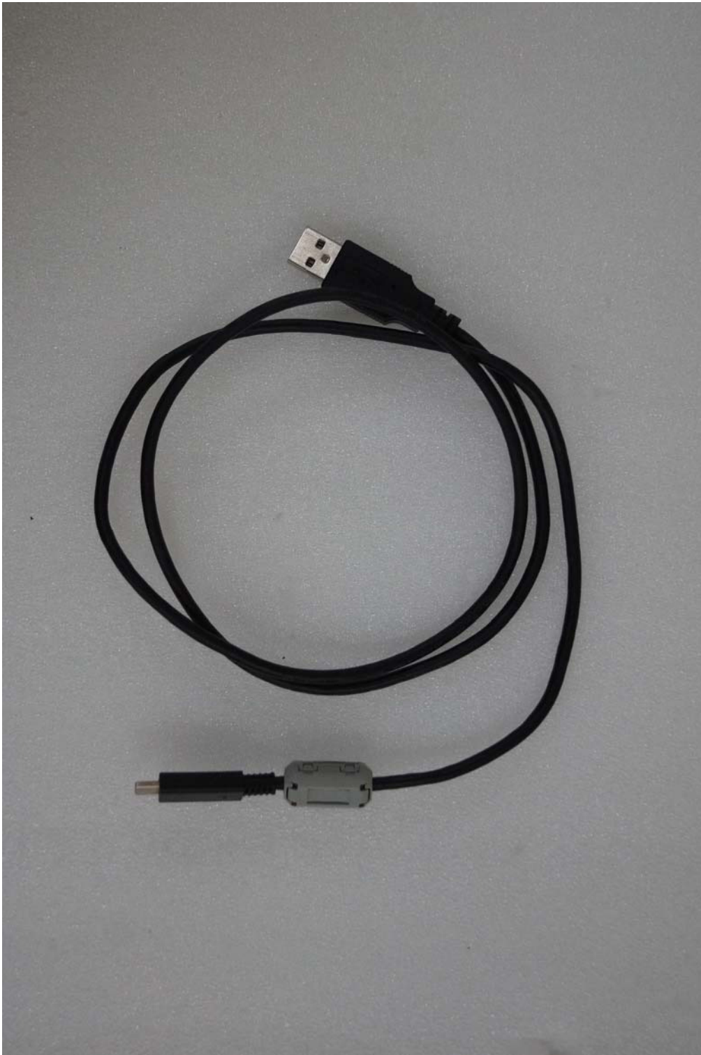
< USB cable >