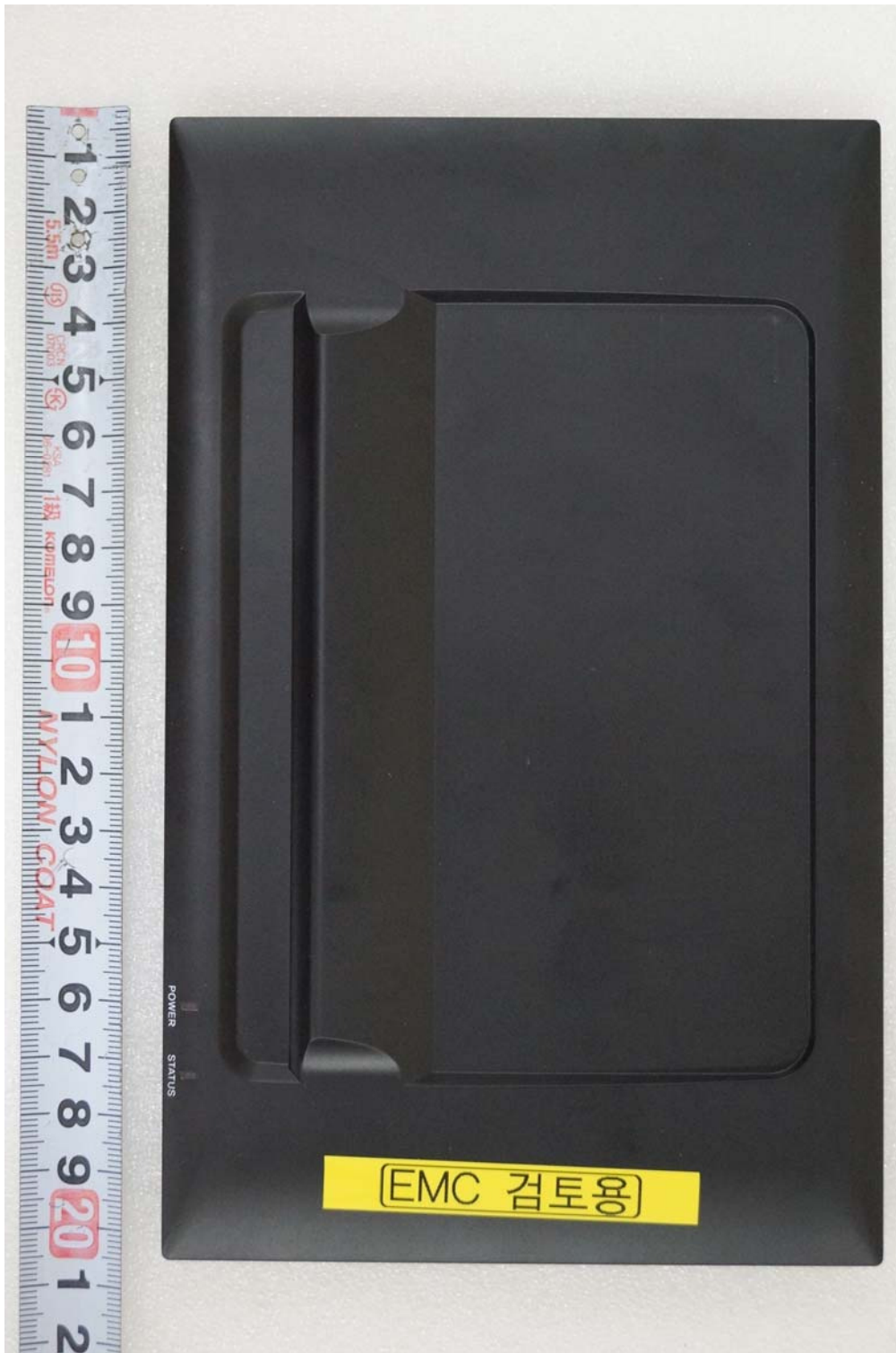
< Top view >