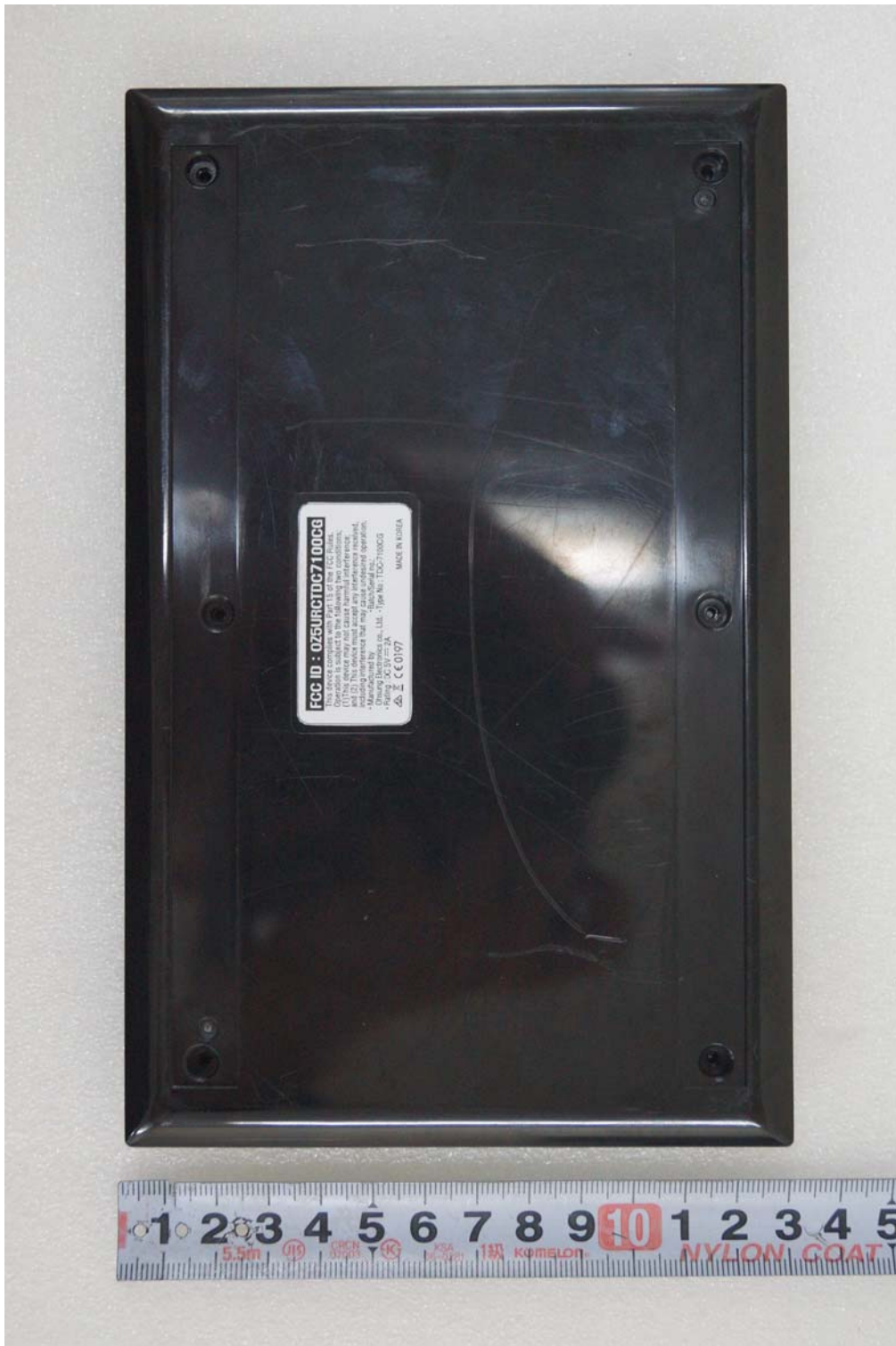
< Bottom view >