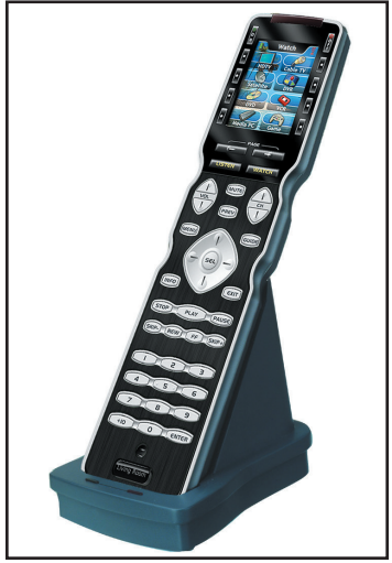
The MX-980 on it's Charger.

The Status light should immediately light. Red indicates that it is charging. Blue shows that it is fully charged. There is no harm in leaving the MX-980 on its charging base whenever it is not in use. The Lithium Ion battery cannot be overcharged.