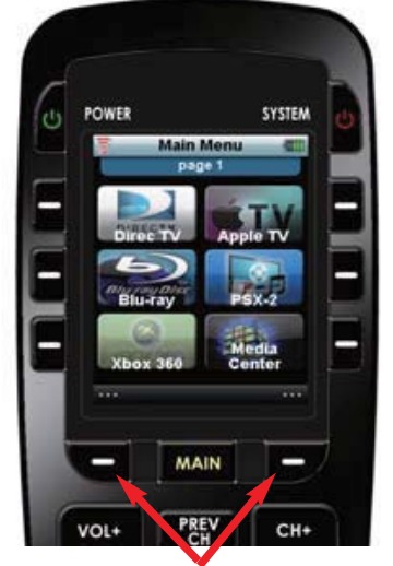
Page buttons reveal the rest of the settings.

There are two pages of Settings screen. To access the other page, press either of the PAGE buttons.