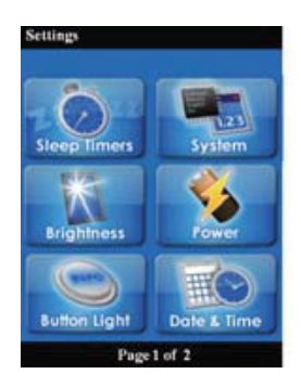
Page 1 of the Settings Screen