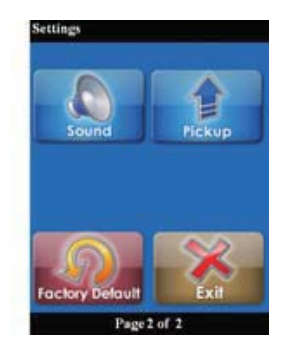
Page 2 of the Settings Screen