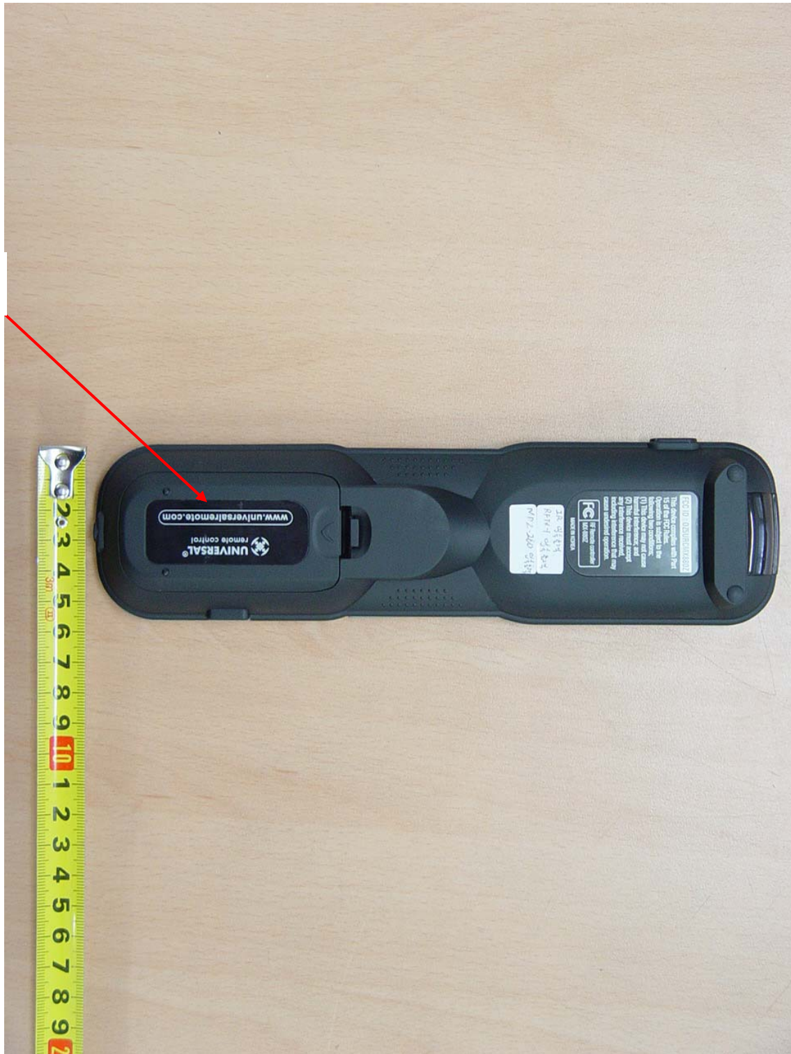
<Rear view of MX-880Z >