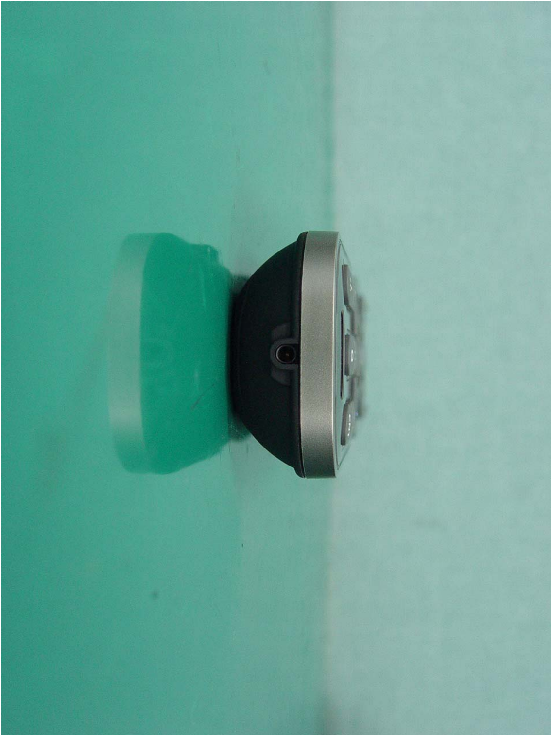
<Lower part view of MX-880Z>