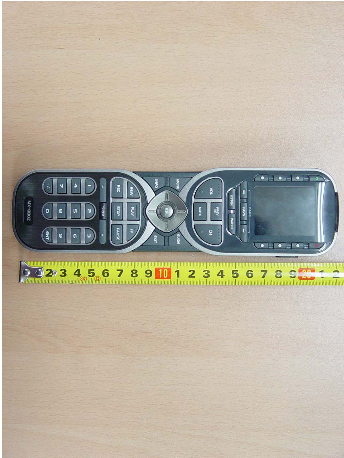
<Front view of MX-880Z >