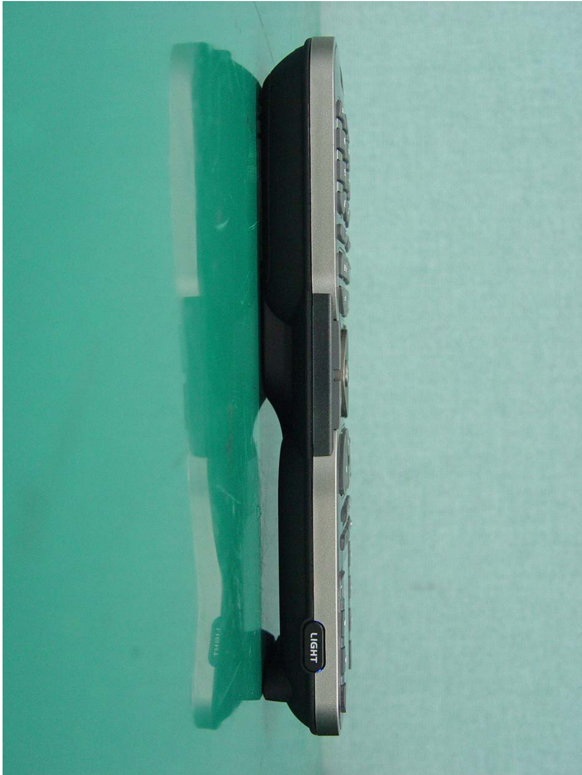
<Right side view of MX-880Z >