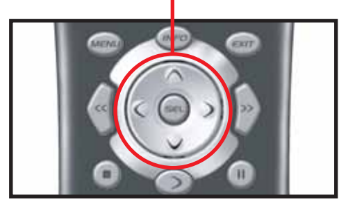
To SELECT or say OK, simply press the center SEL button. You'll feel the click as the OK/SELECT/ENTER command is sent.

The thumbpad easily operates on screen menus with either the Left or Right hand. When you are operating a device with any kind of on-screen menu, guide or display, the thumbpad offers you easy one-handed control with your thumb.