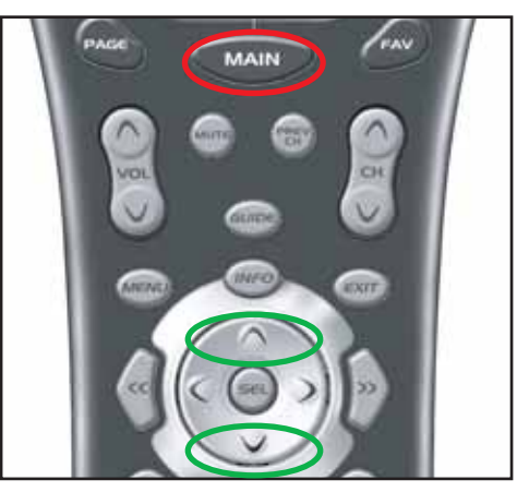
Press and Hold BOTH the MAIN and the DOWN thumbpad button at the same time to make it LIGHTER.

Press and Hold BOTH the MAIN and the UP thumbpad button at the same time to make the screen DARKER.