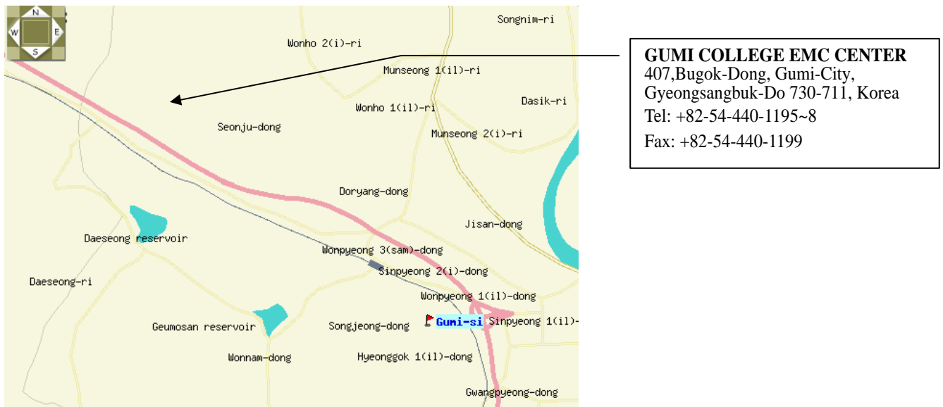
Fig 1. The map above shows the Gumi College in vicinity area.

This test site is one of the highest point of Gumi 1 college at about 200 kilometers away from Seoul city and 40 kilometers away from Daegu city. It is located in the valley surrounded by mountains in all directions where ambient radio signal conditions are quiet and a favorable area to measure the radio frequency interference on open field test site for the computing and ISM devices manufactures. The detailed description of the measurement facility was found to be in compliance with the requirements of §2.948 according to ANSI C63.4 on October 19, 1992