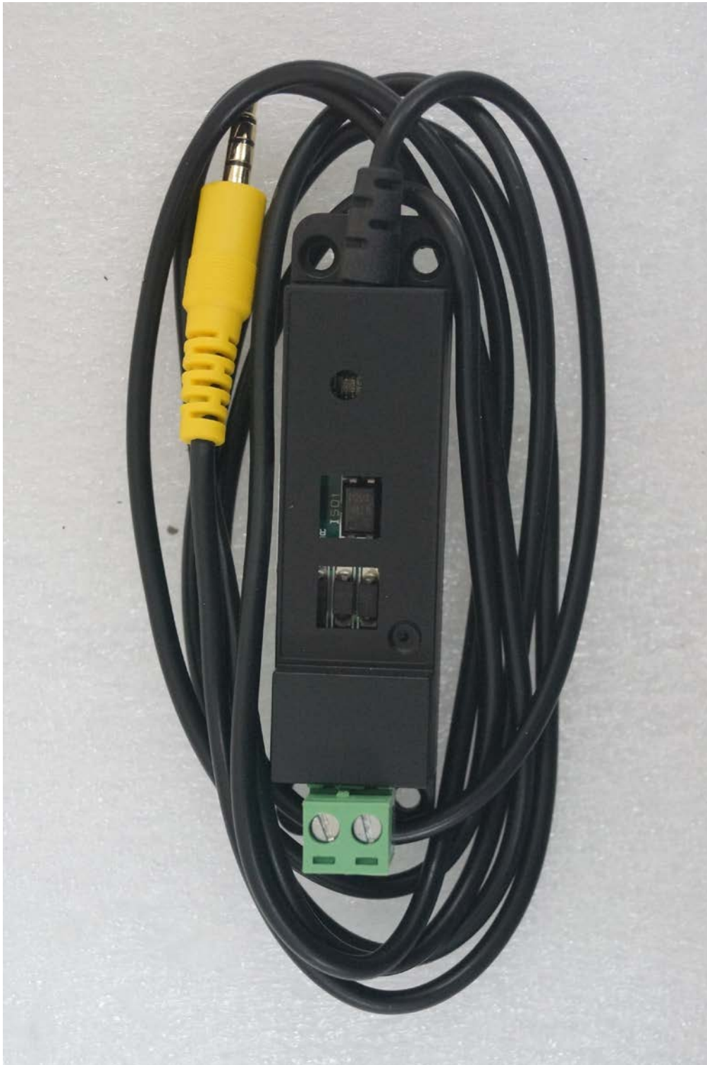
< VOLTAGE Sensor >