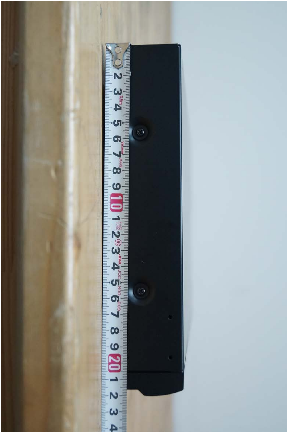
< Left side view >