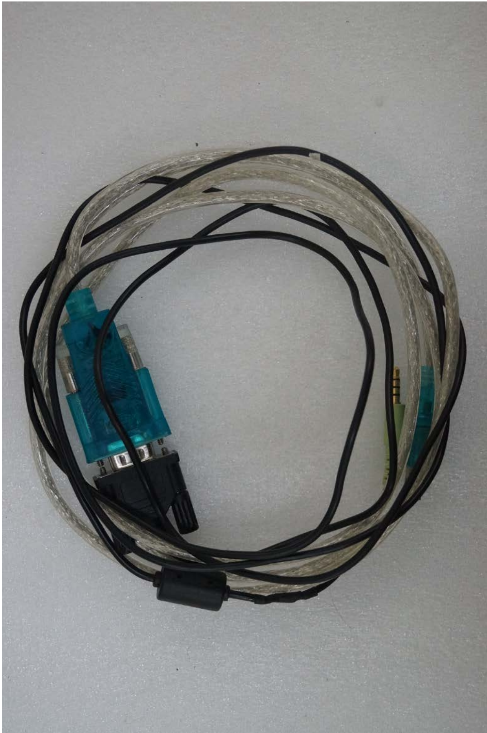
< RS232C cable >