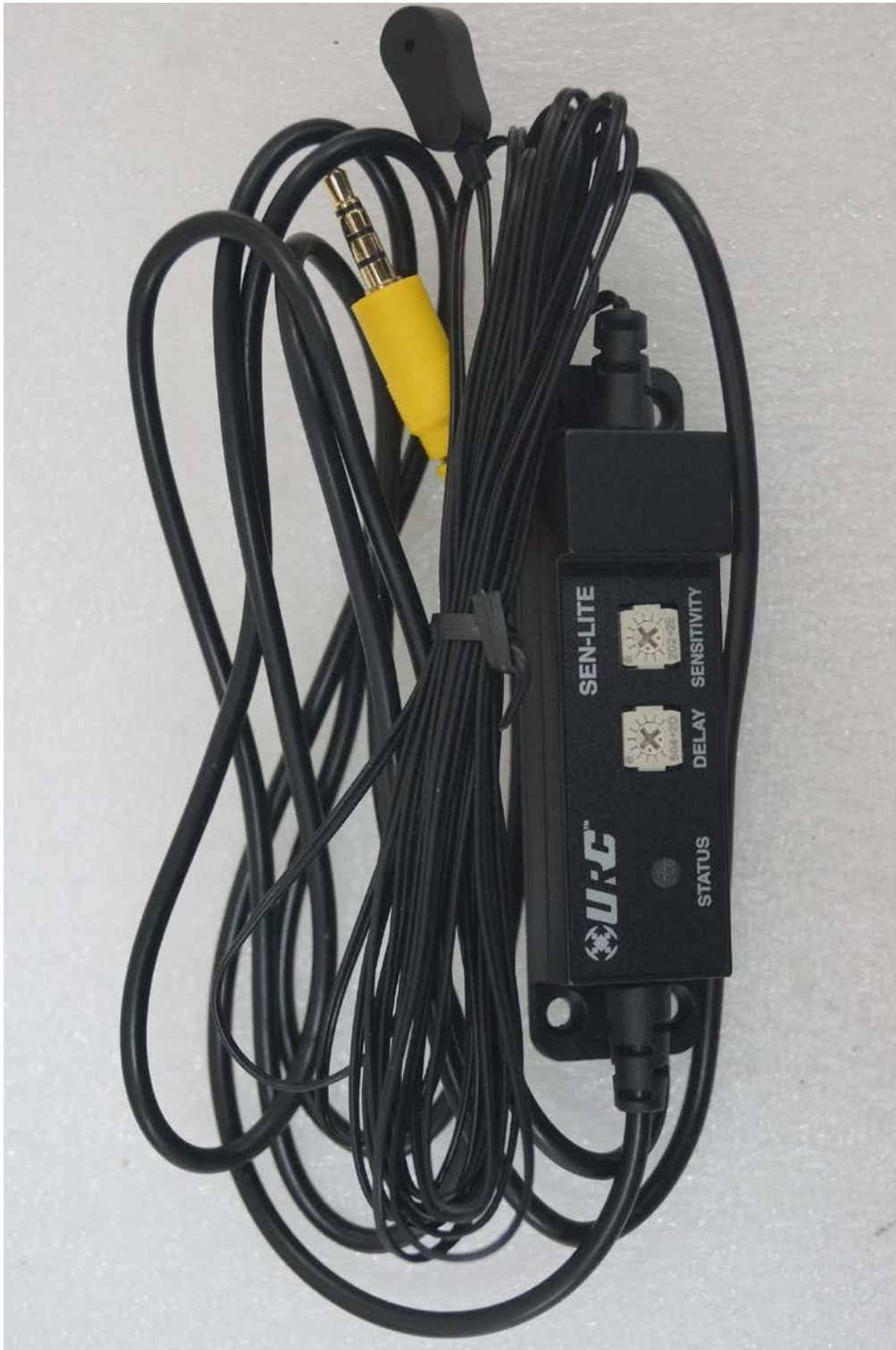
< AMBIENT LIGHT Sensor >