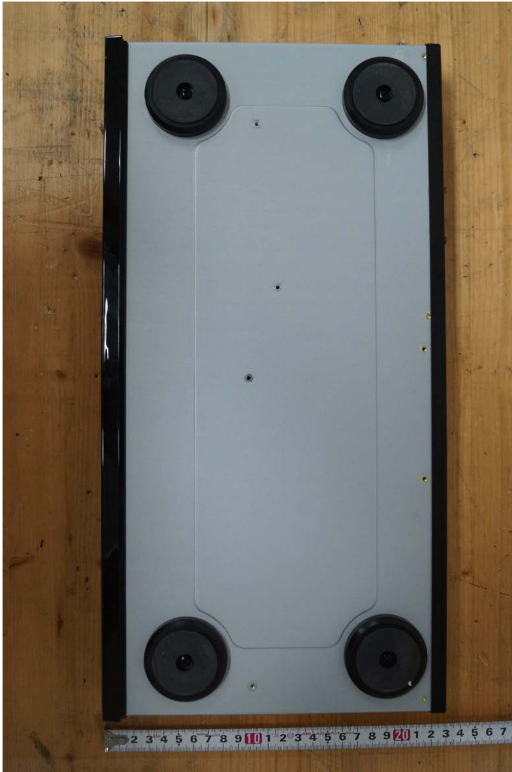
< Bottom view >