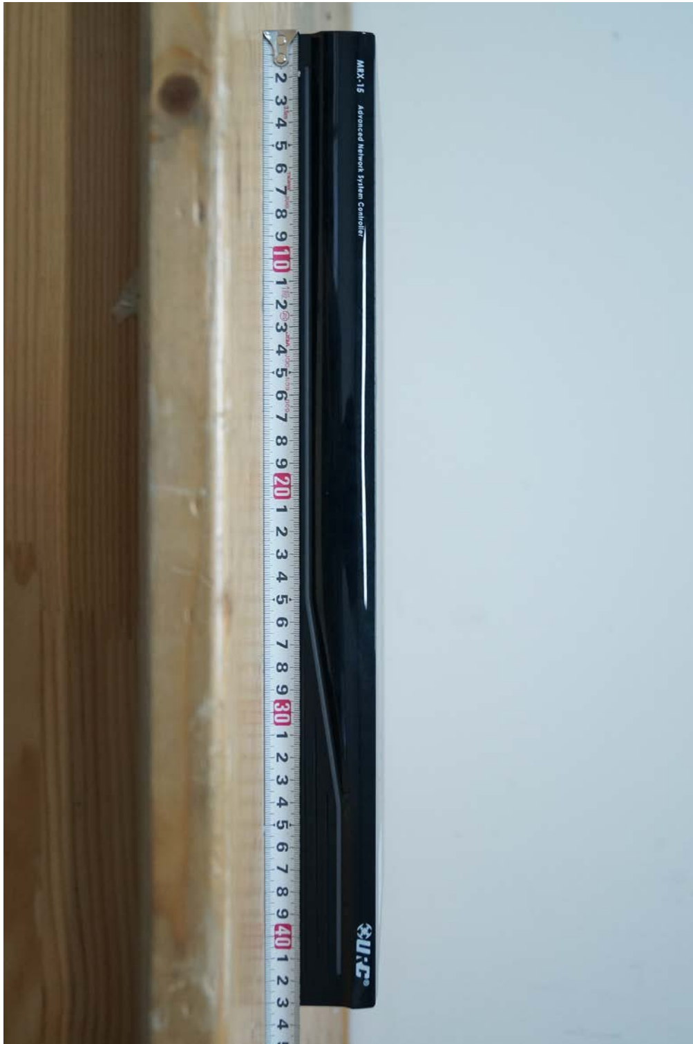
< Front view >