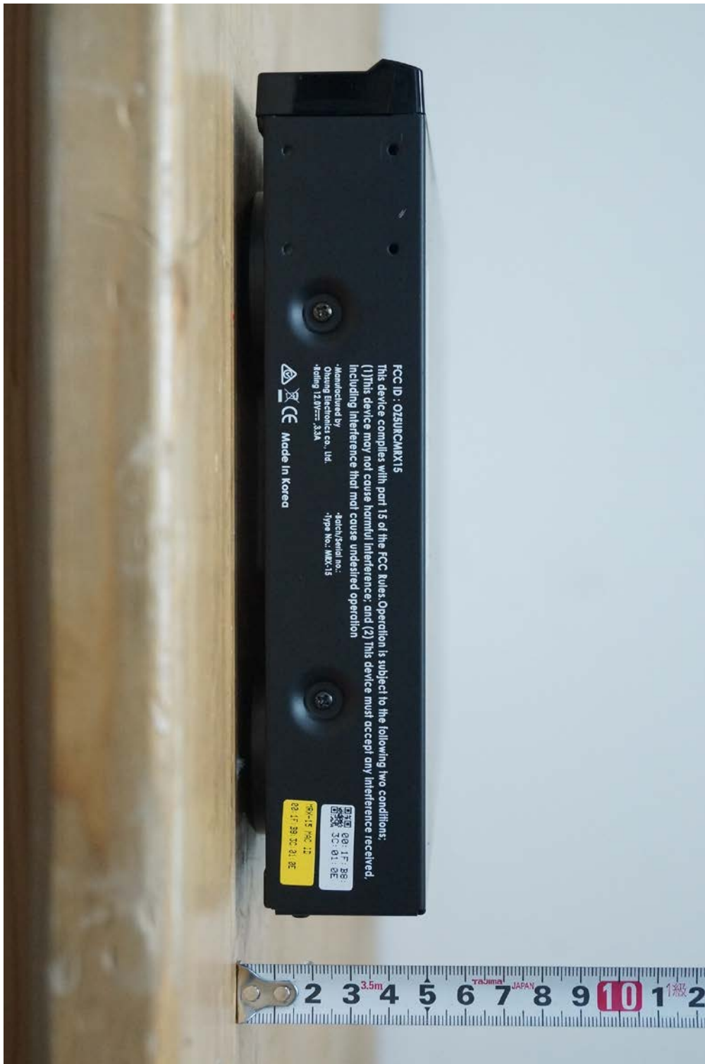
< Right side view >