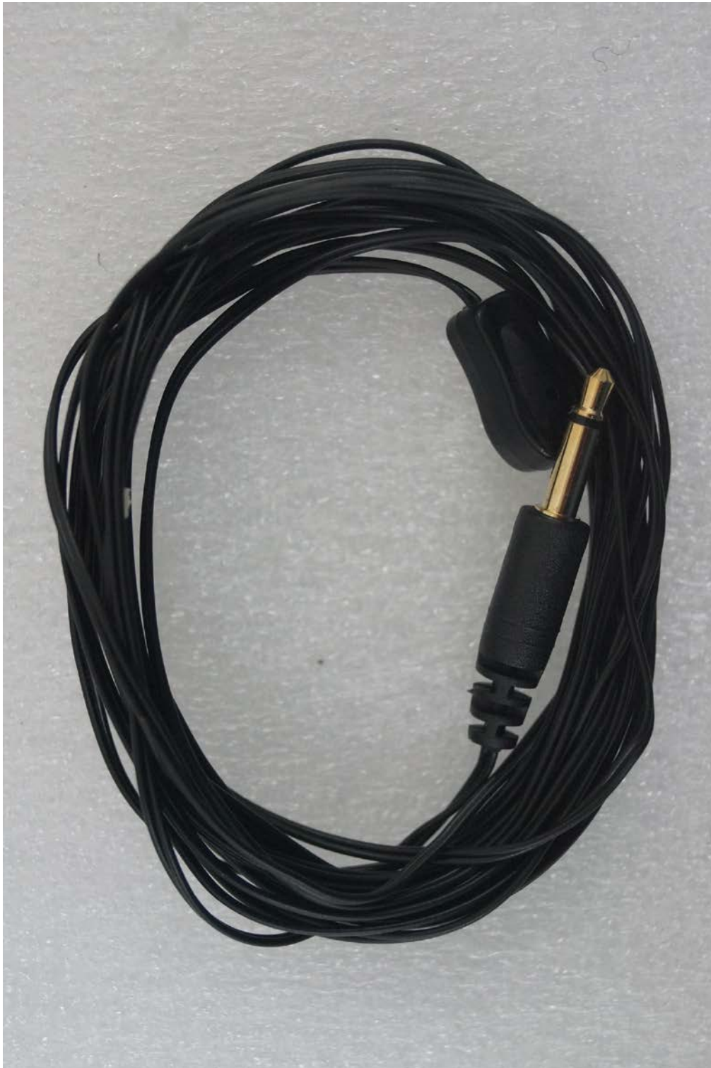
< IR Emitter >