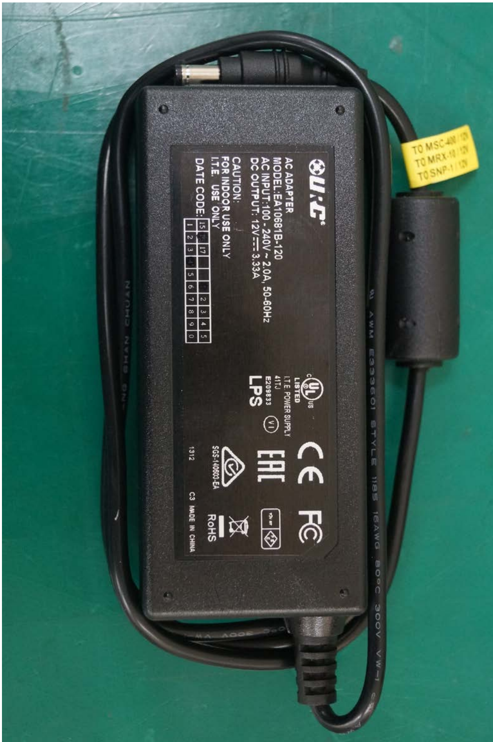
< AC/DC Adaptor >