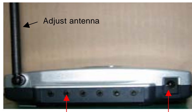
Connect IR Extender cable jack. Connect DC9V Power supply.