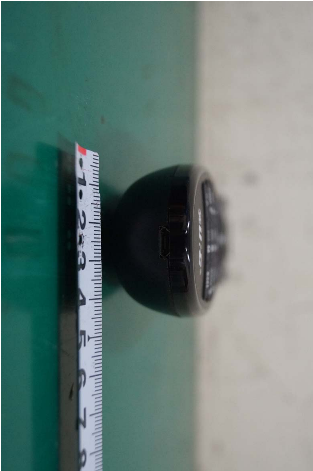
< Rear side view >