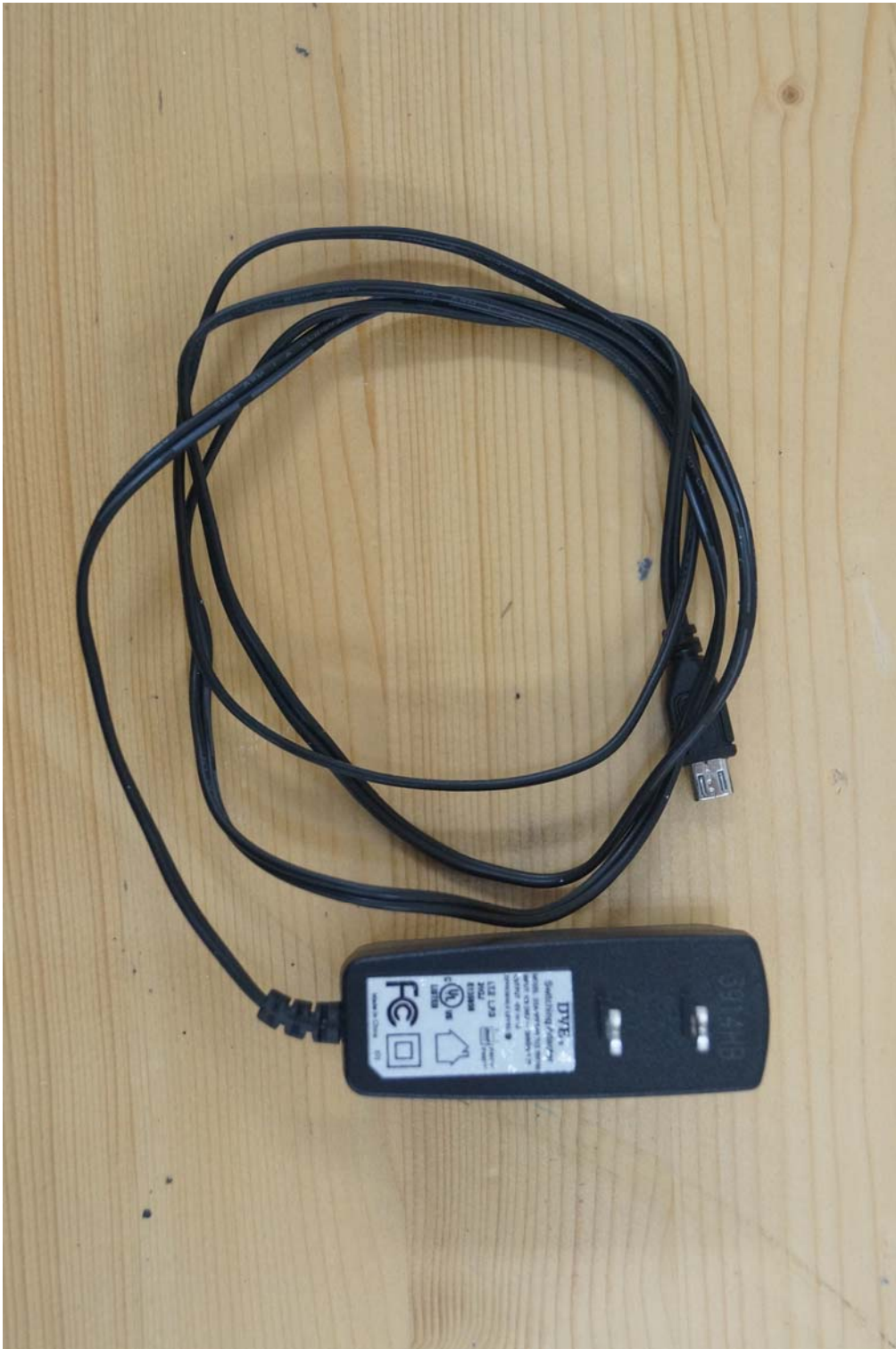
< AC/DC adaptor >