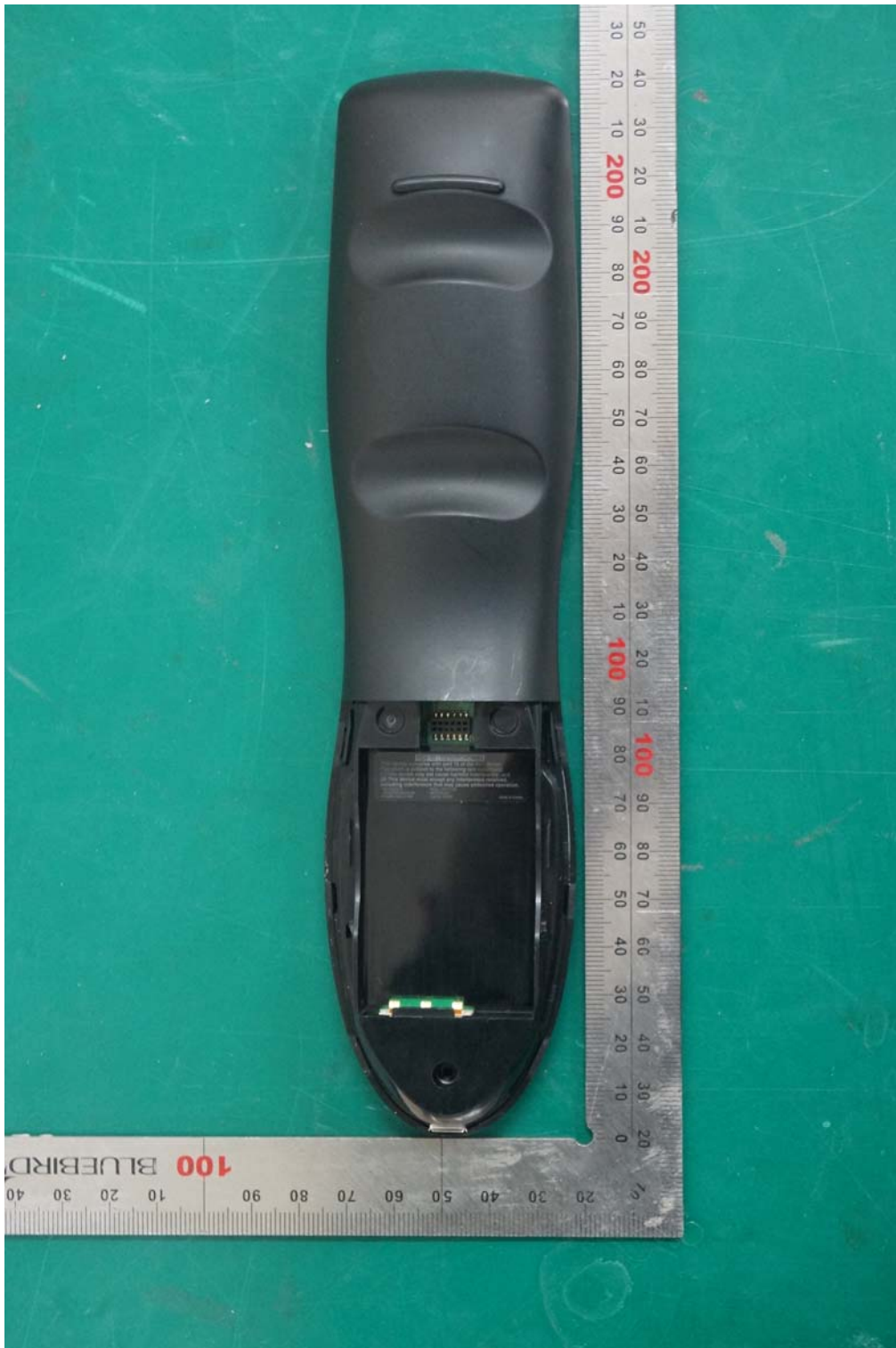
< Bottom view remove battery case and battery >