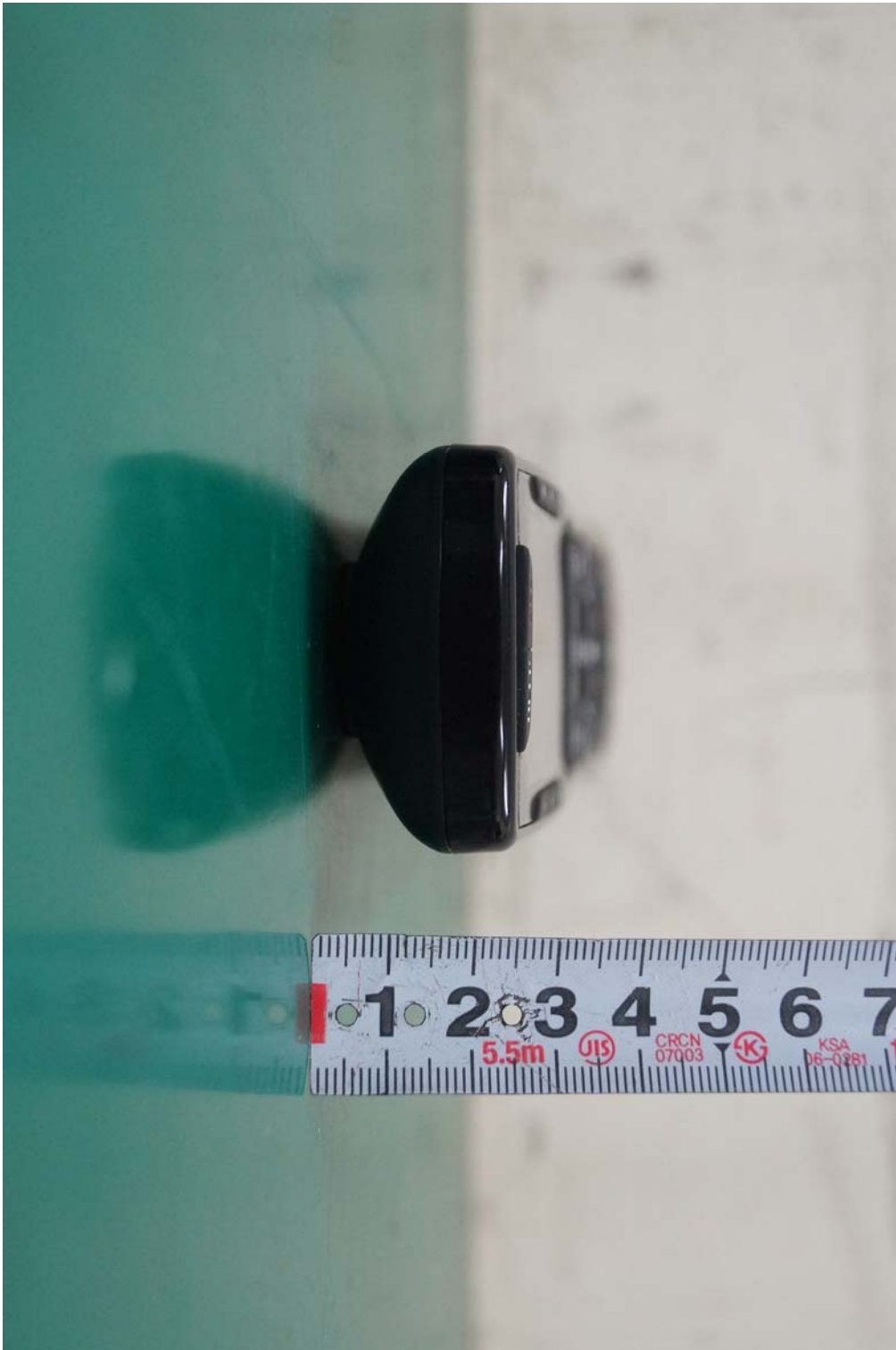
< Front side view >