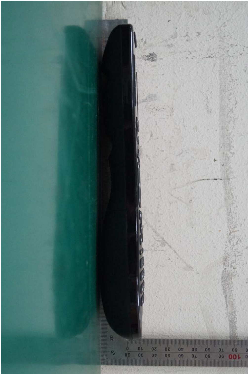
< Left side view >