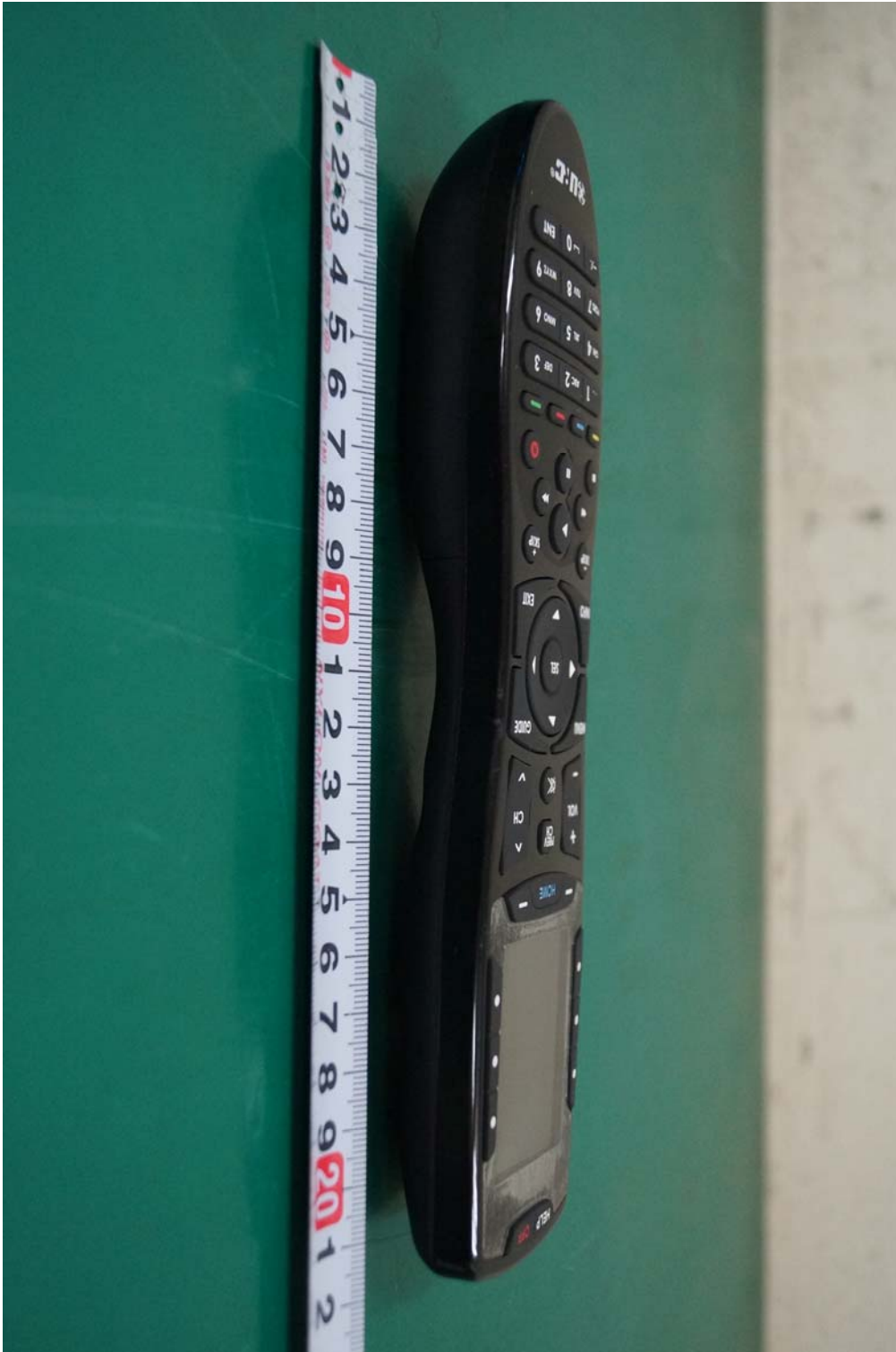
< Right side view >