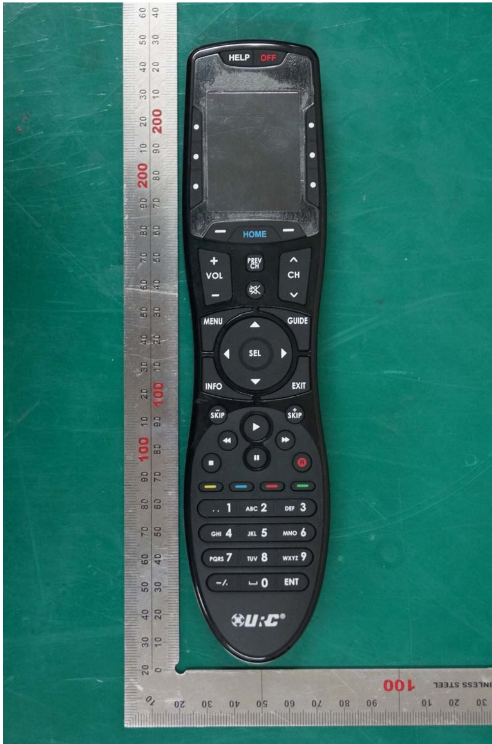
< Top view >