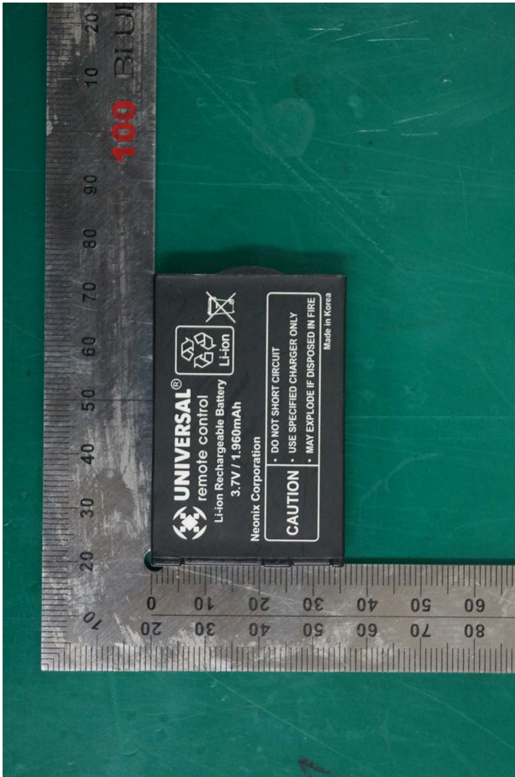
< battery top view >