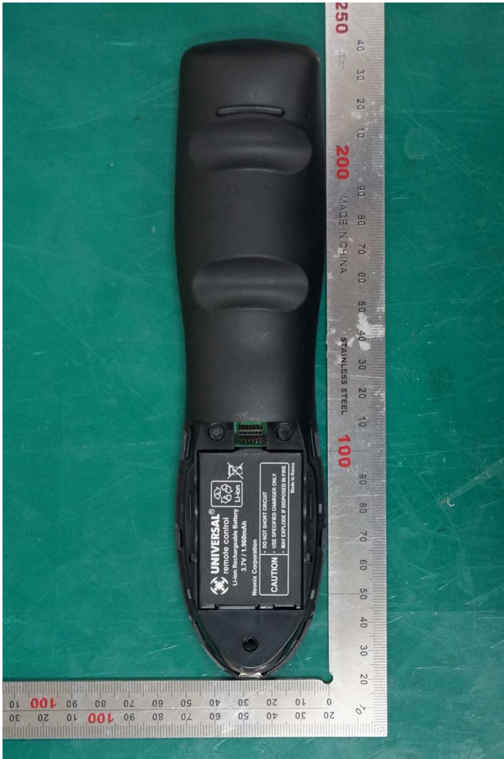
< Bottom view remove battery case >