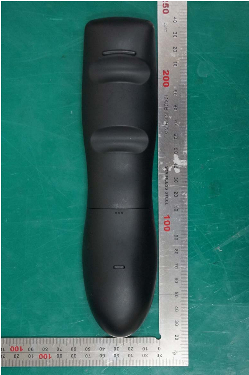
< Bottom view >