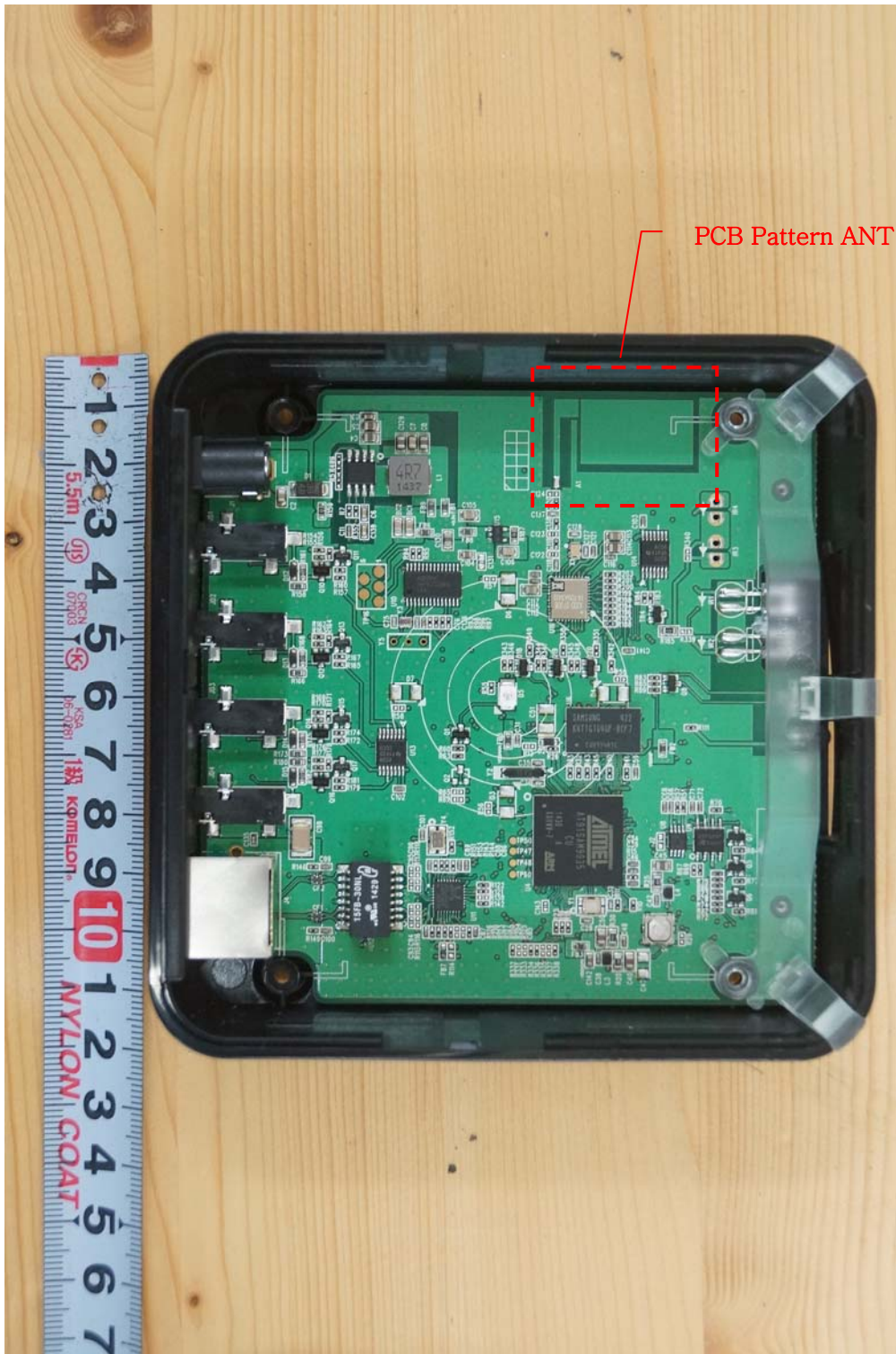
< Inside top view >