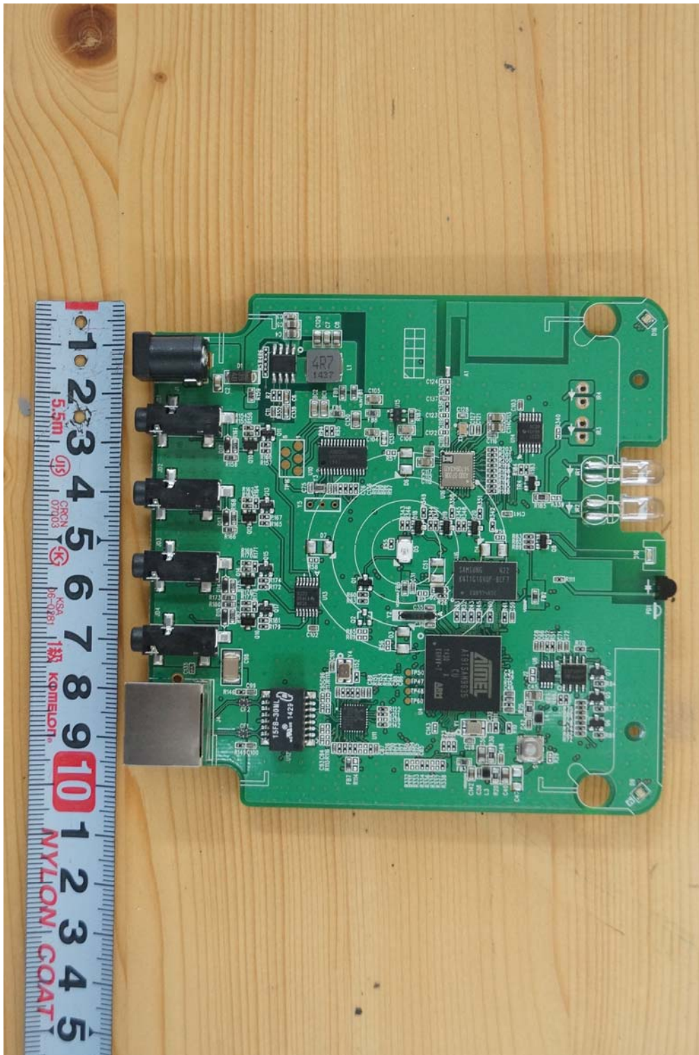
< Main board top view >