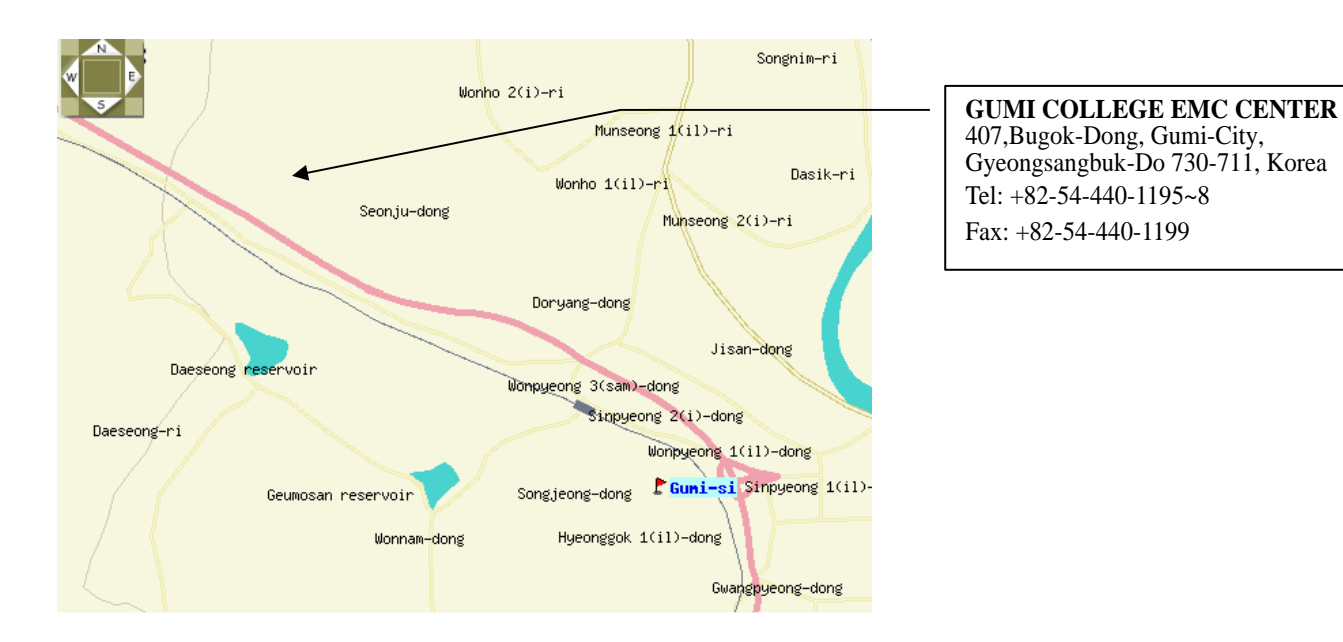
Fig 1. The map above shows the Gumi College in vicinity area.

This test site is one of the highest point of Gumi 1 college at about 200 kilometers away from Seoul city and 40 kilometers away from Daege city. It is located in the valley surrounded by mountains in all directions where ambient radio signal conditions are quiet and a favorable area to measure the radio frequency interference on open field test site for the computing and ISM devices manufactures. The detailed description of the measurement facility was found to be in compliance with the requirements of $2.948 according to ANSI C63.4 on October 19, 1992