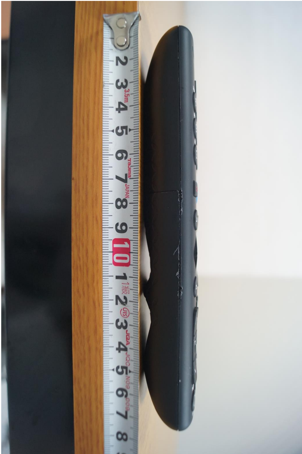
< Right Side >