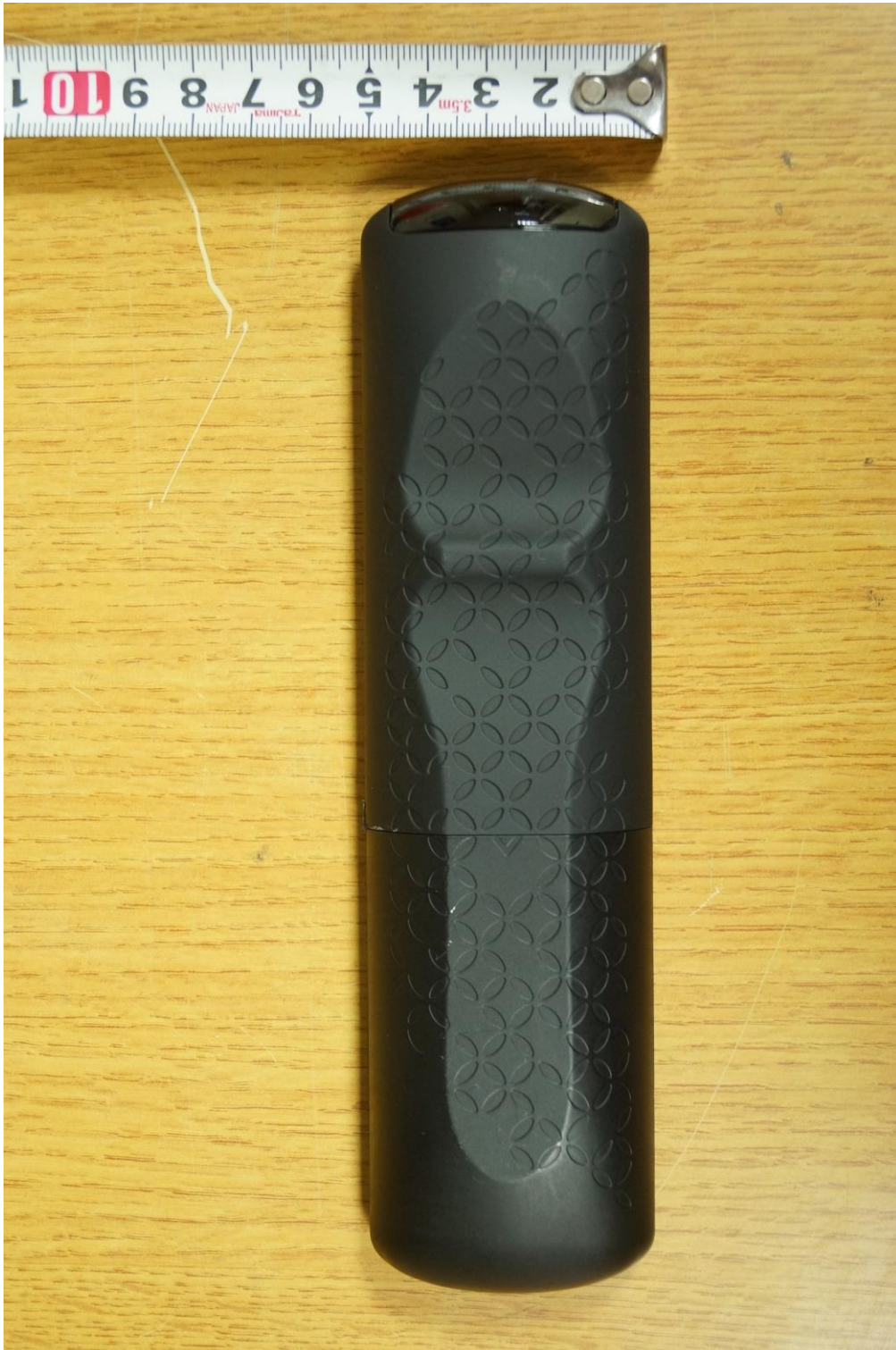
< Rear view #1 >