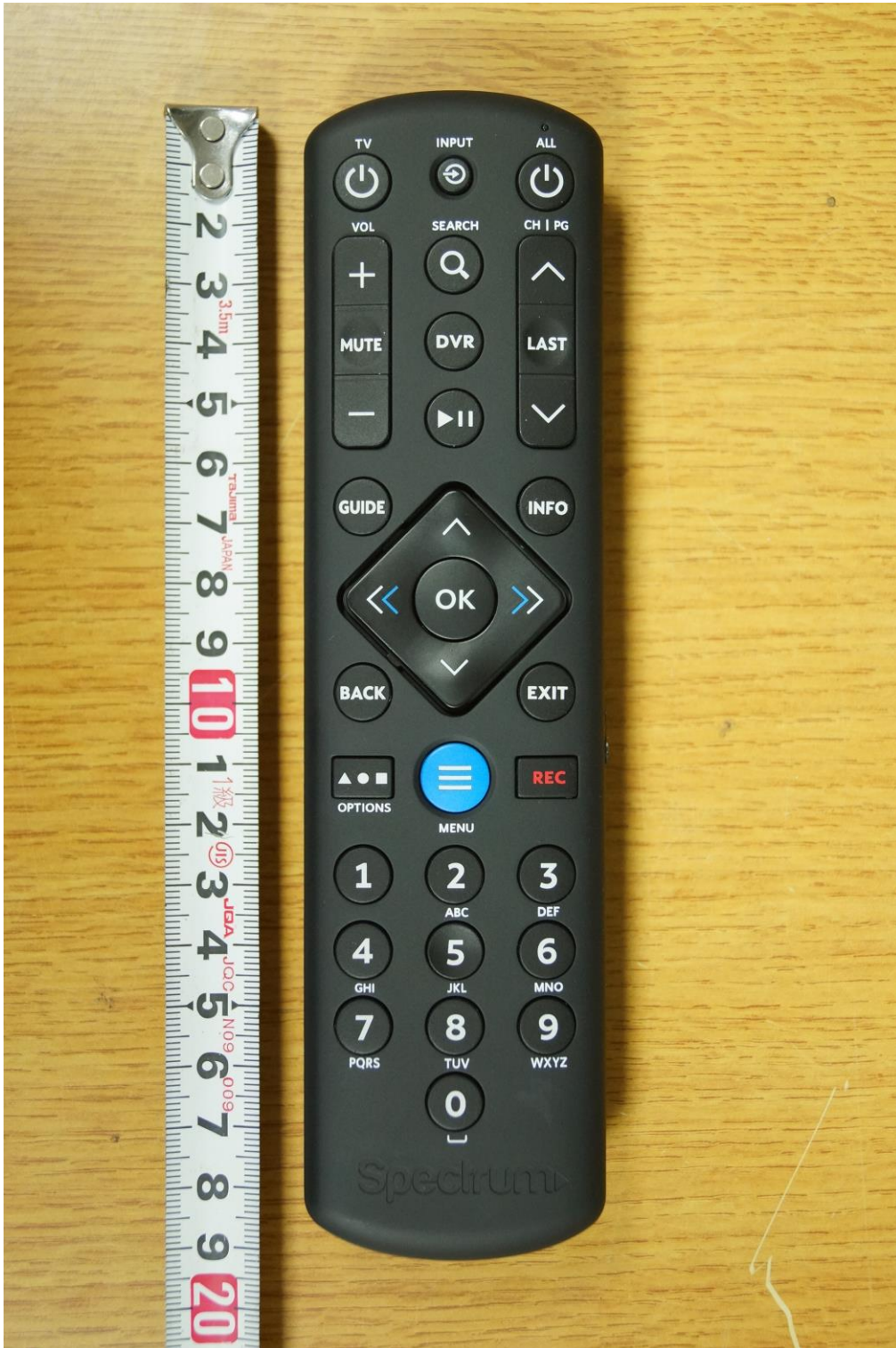
< Front view >