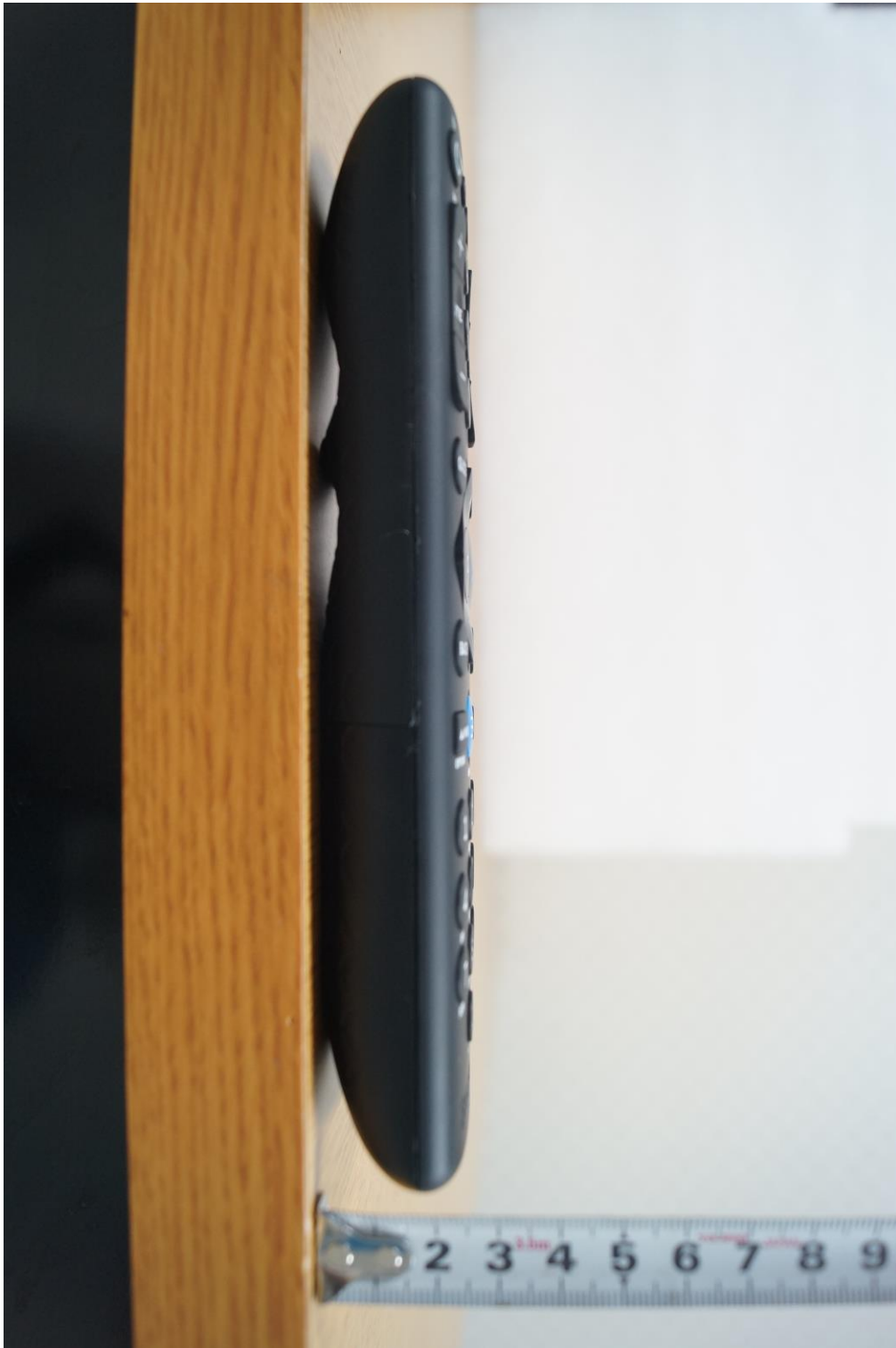
< Left Side >