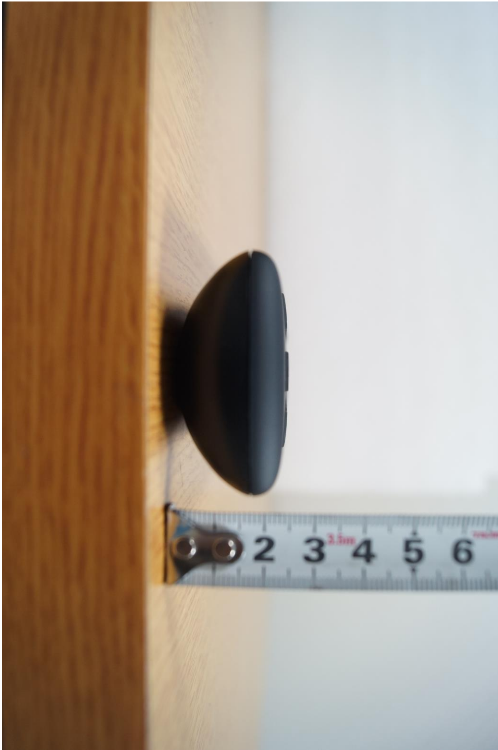
< Bottom Side >