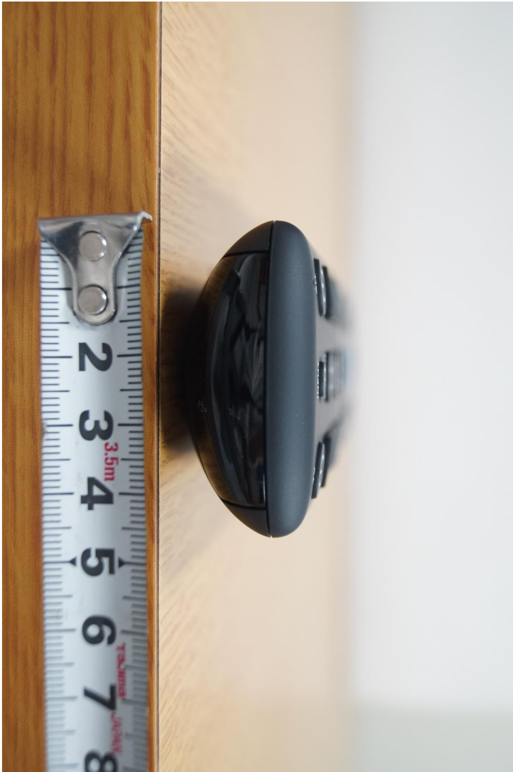
< Top Side >