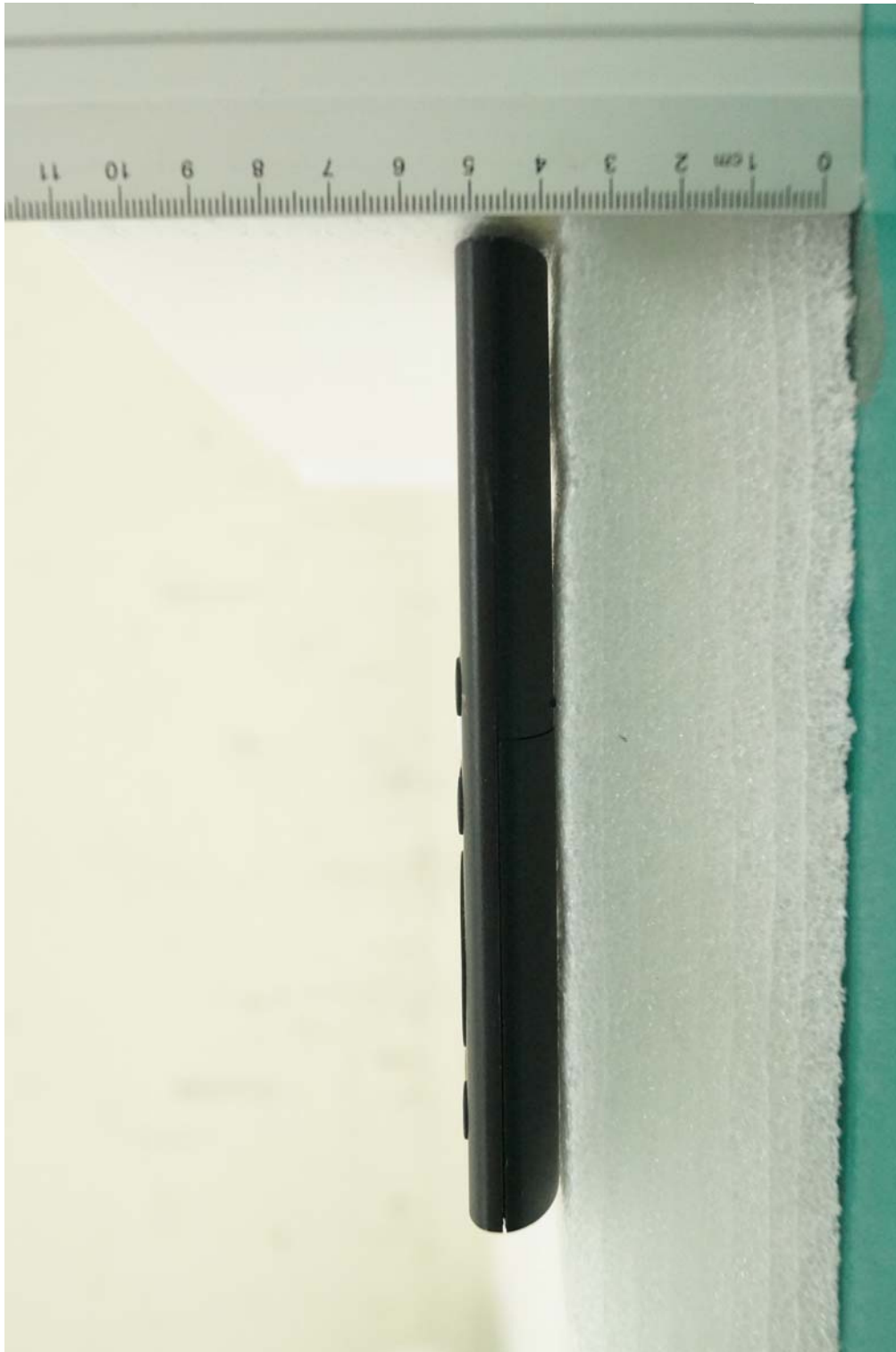
< Right Side >