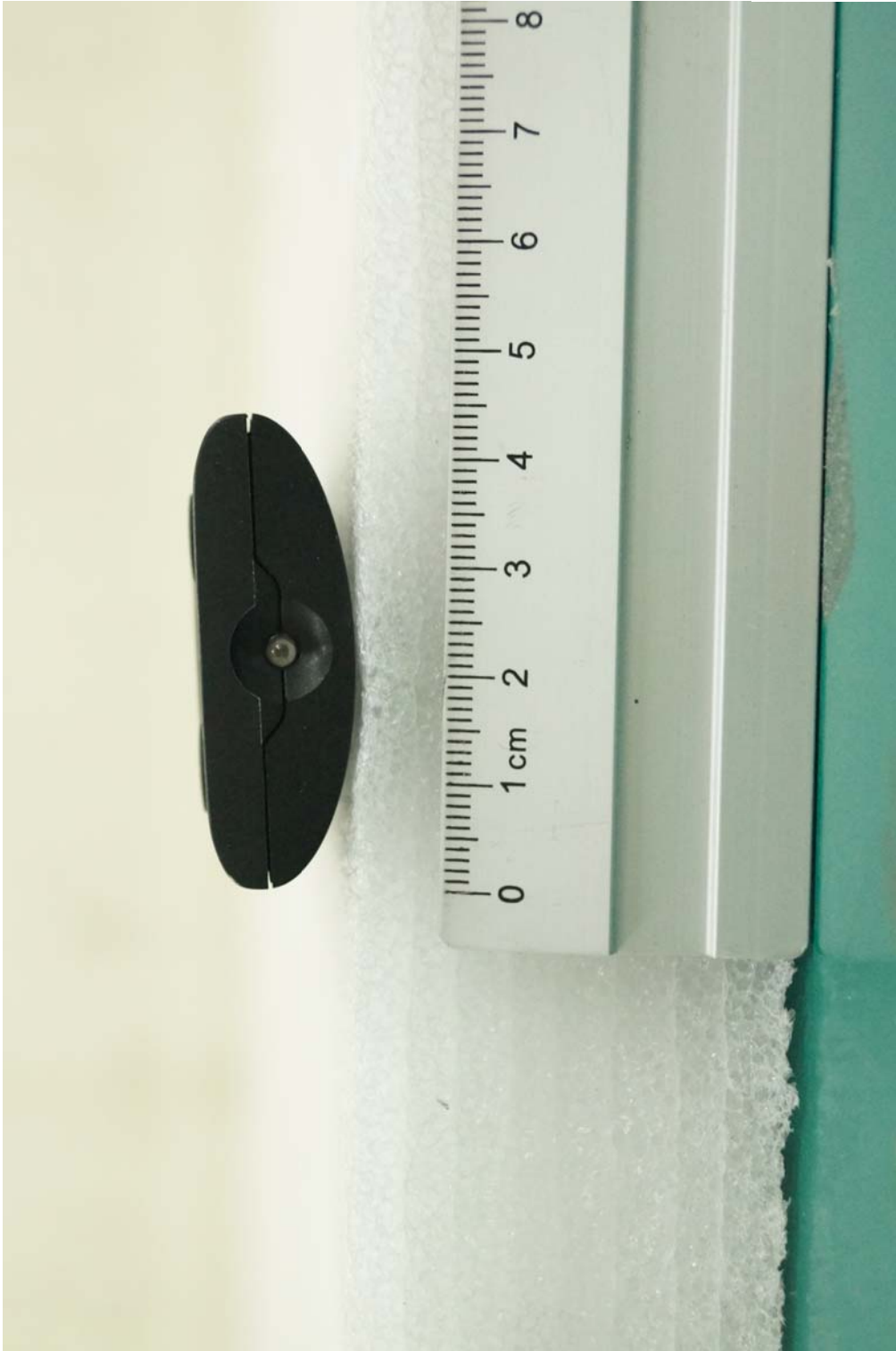
< Top Side >