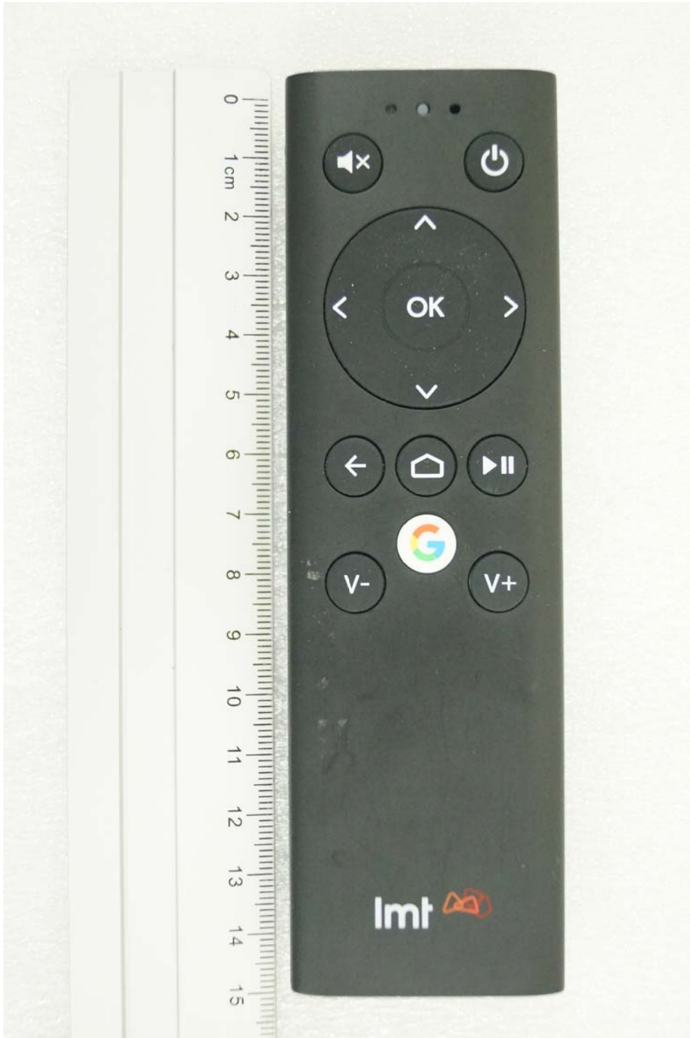
< Front view >