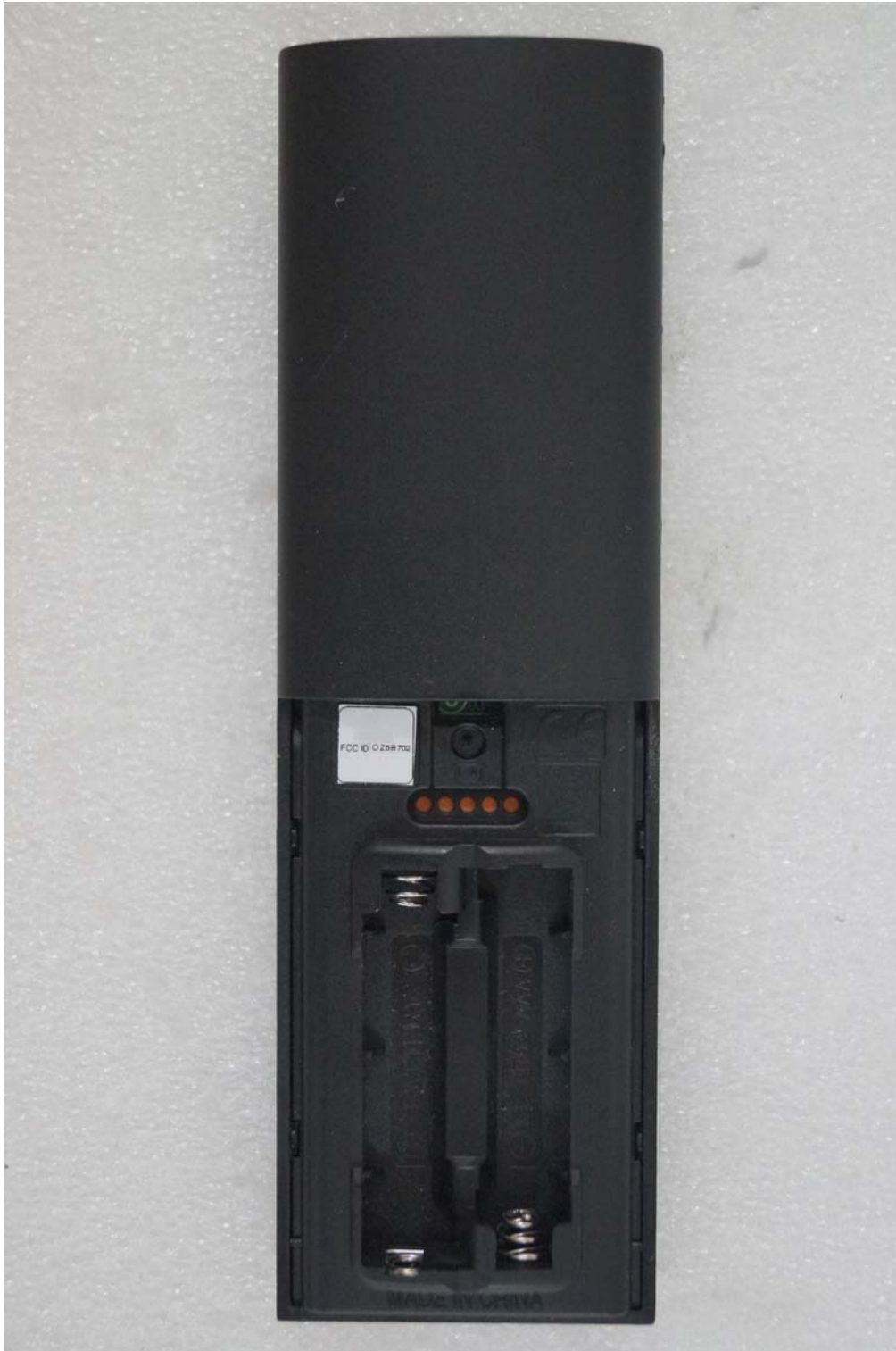
< Rear view#2 >