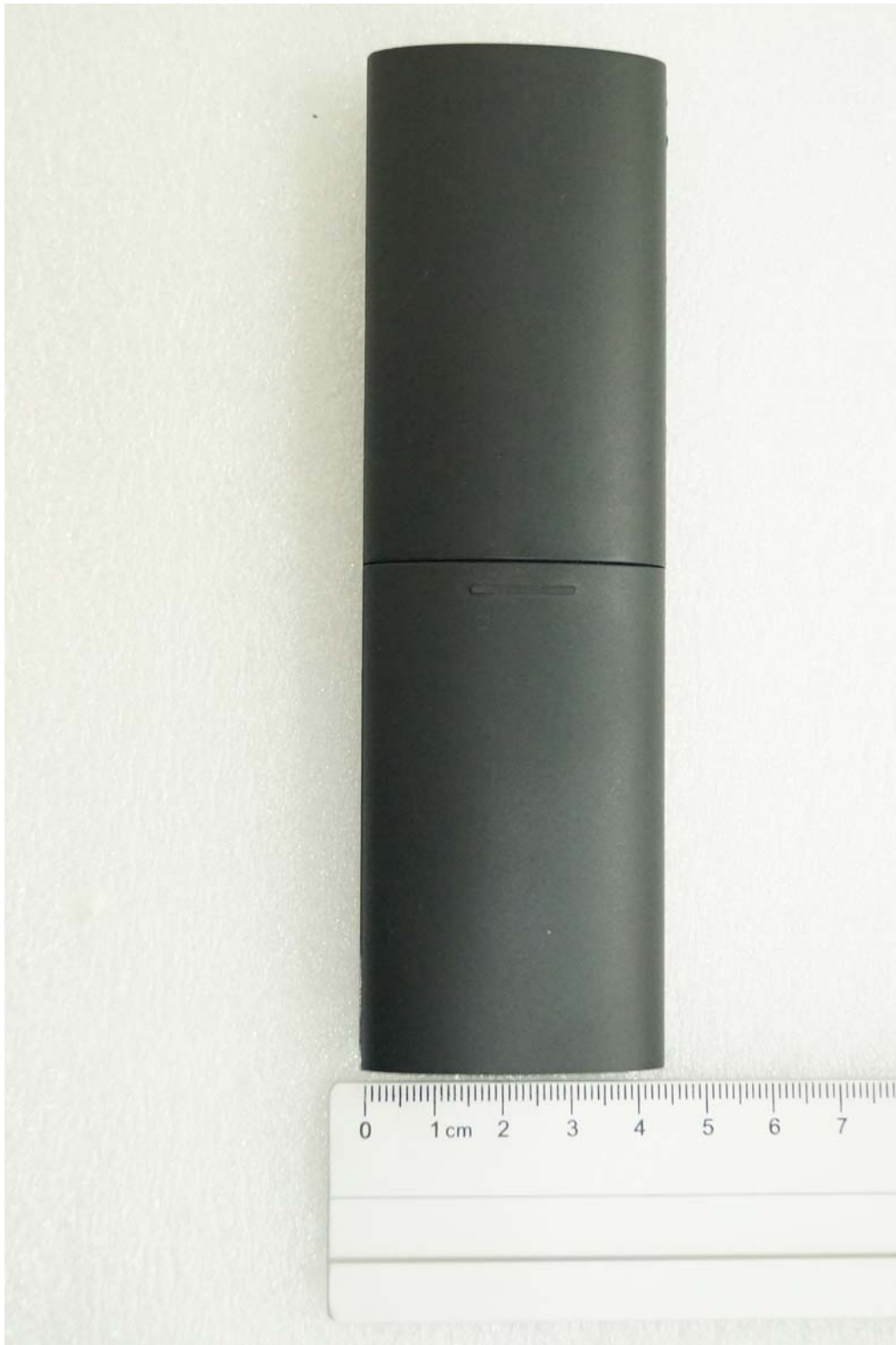
< Rear view#1 >