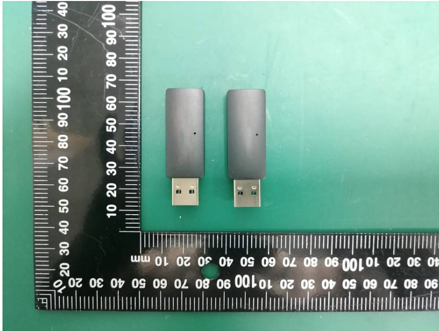
For Model: CF-AC1300