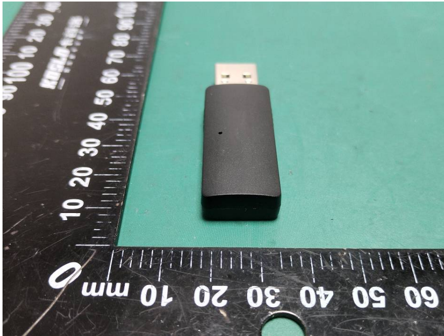
For model: CF-913AC V2