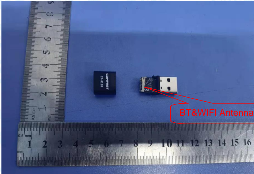
Photo 6 Internal of EUT