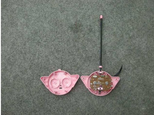
Front View of the product (Internal)