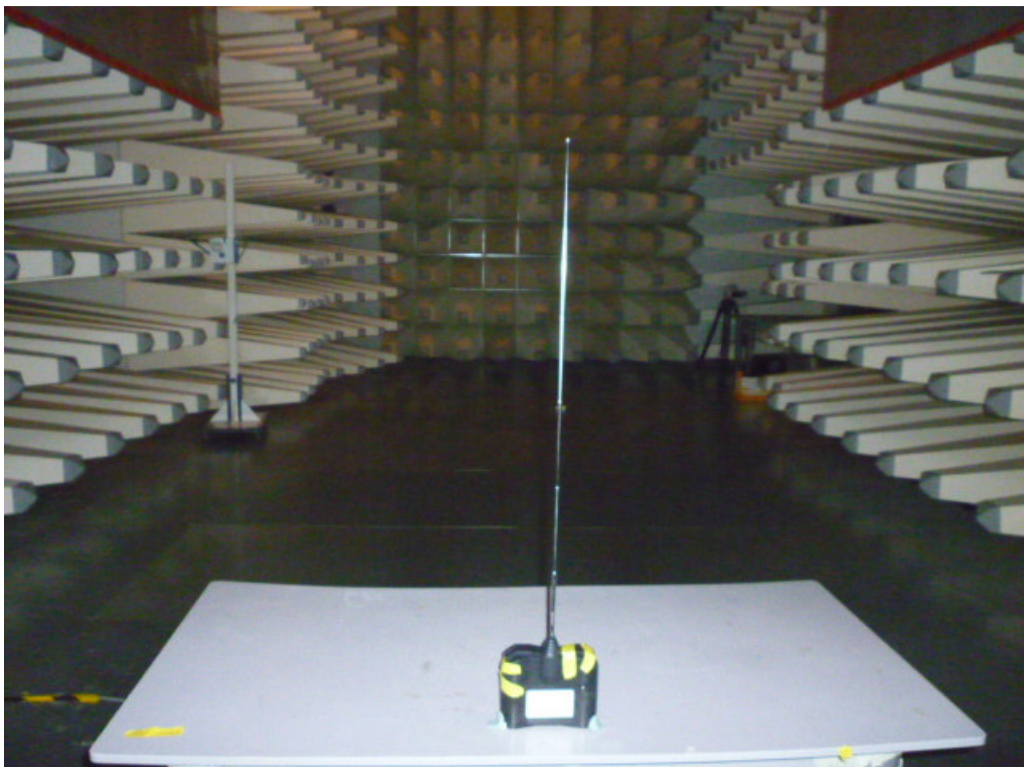
Set-up for Radiation Emission (Transmitter)