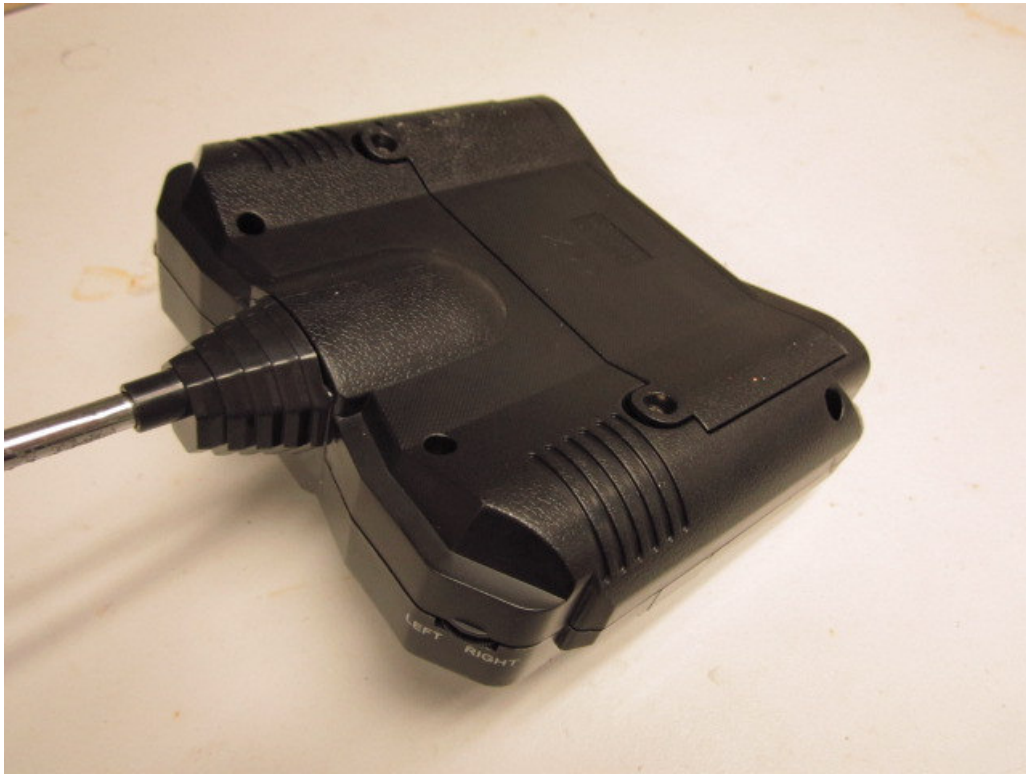
Transmitter (External view)